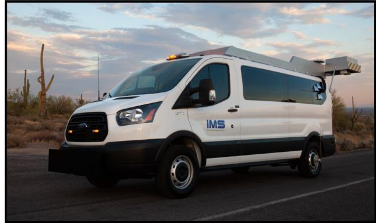
Pavement Survey Vehicle