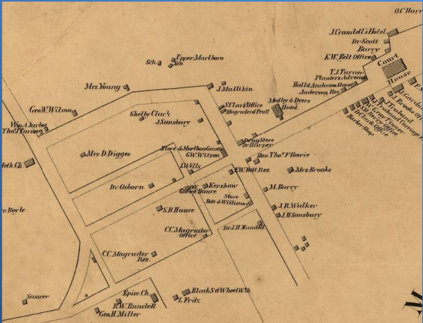
1861 Martenet Map