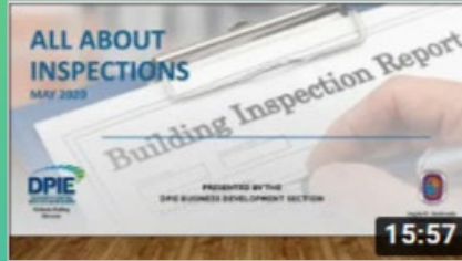
All about Inspections

The material is either provided as a YouTube video or a PDF file and may be accessed here .