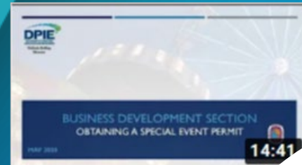
Obtaining a Special Events Permit