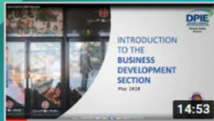
Introduction to the Business Development Section