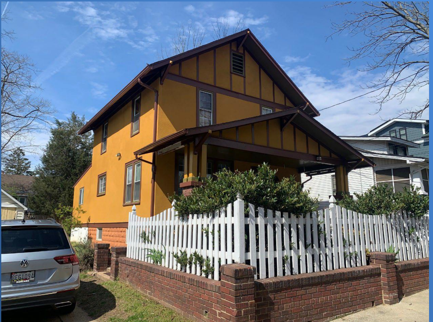
John and Mary White House, southeast corner, April 2022