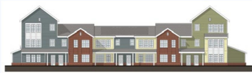
Glenarden Phase 3, 9% Project