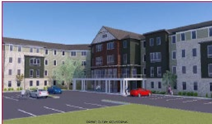
Birchwood at Upper Marlboro Project