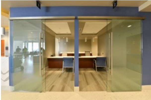
Private registration alcoves