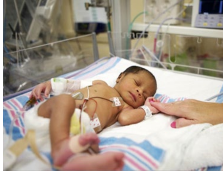
Level II, Special Care Nursery