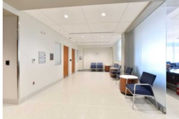
Triage rooms with separate waiting area