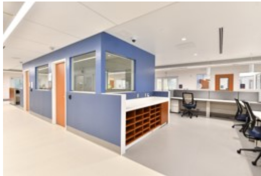
ED Nurses Station