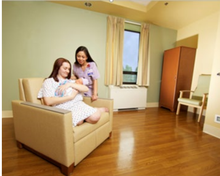
Women and Newborns Center