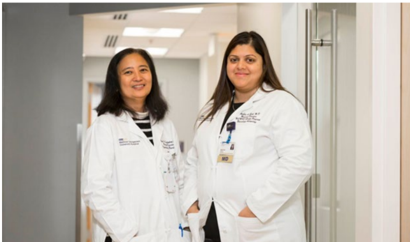
Neurology & Stroke Center