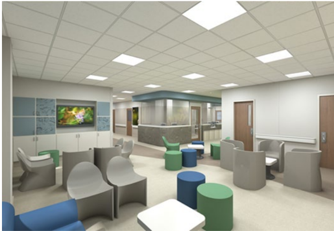
Architectural CAD renderings