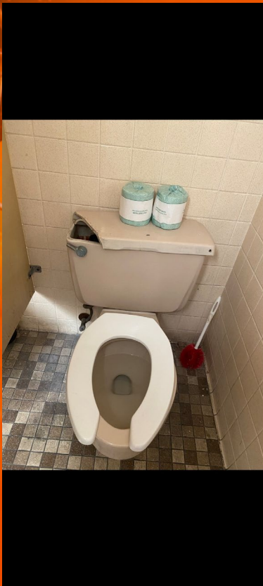
Bathroom Station 843