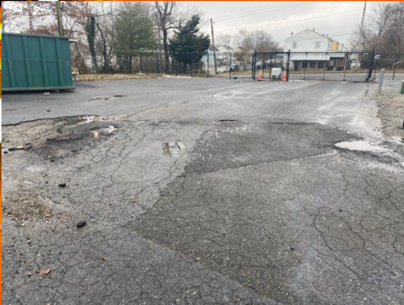
Parking Lot at Station 833