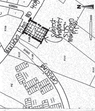
Vicinity Map Scale 1"=200'