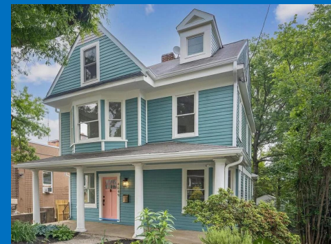
Flynn-Steck House 4049 34 th Street, Mount Rainier (68-074-04)