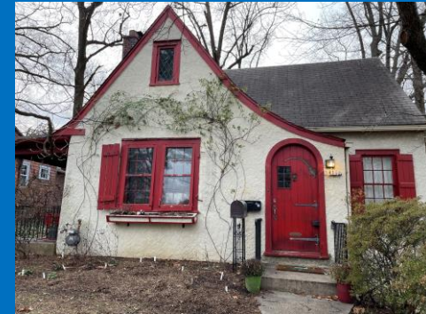
Blair-Smith House 5416 39 th Street, Hyattsville (68-010-94)