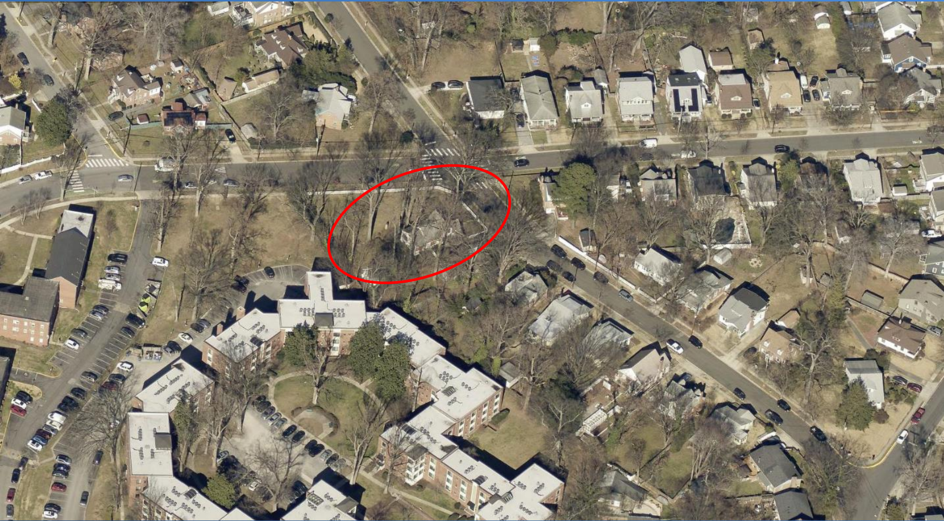
Blair-Smith House Oblique aerial view, February 2024