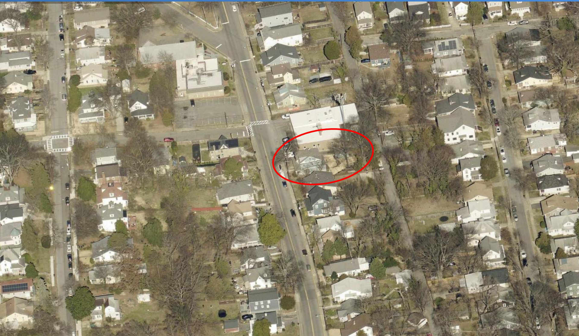
Flynn-Steck House Oblique aerial view, February 2024