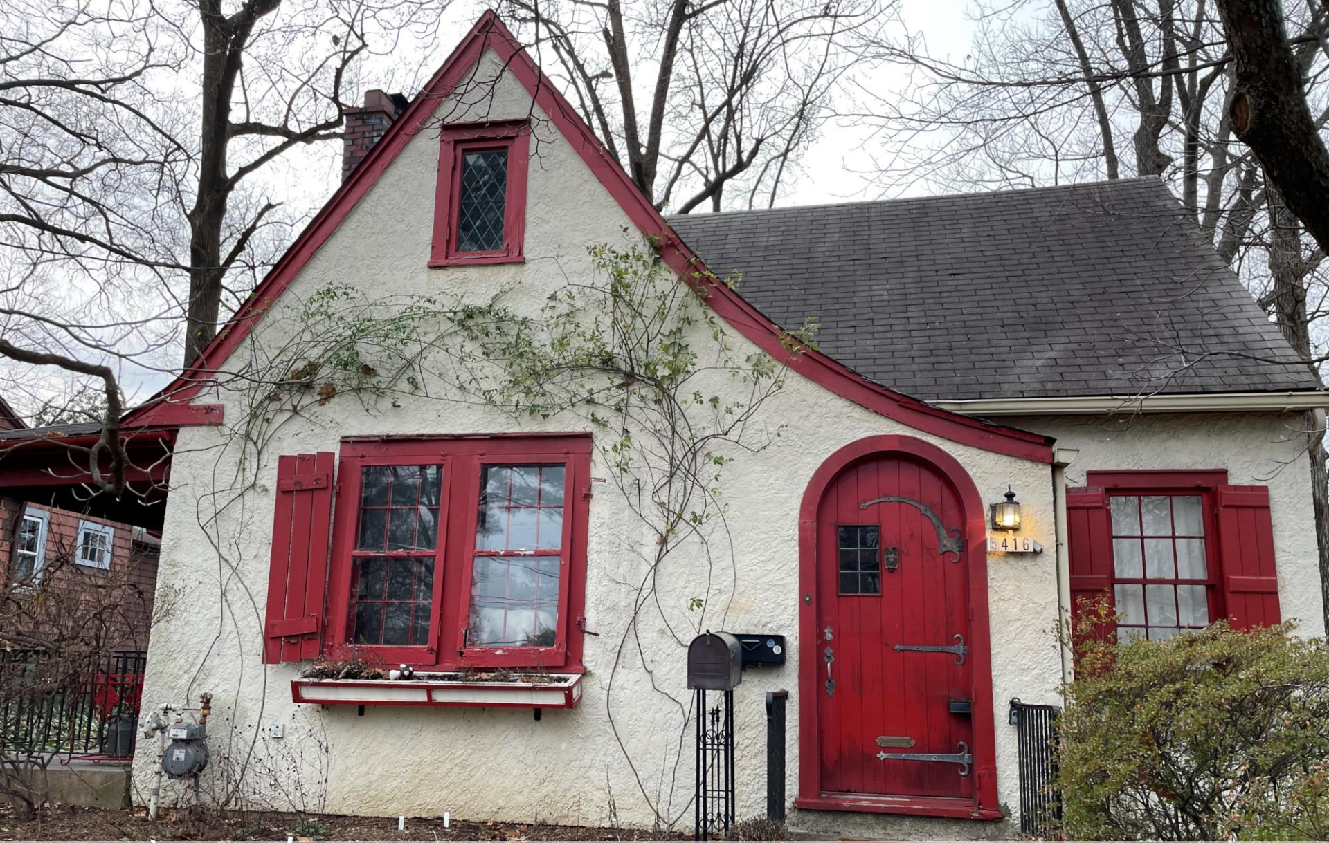
Blair-Smith House 5416 39 th Street, Hyattsville (68-010-94)