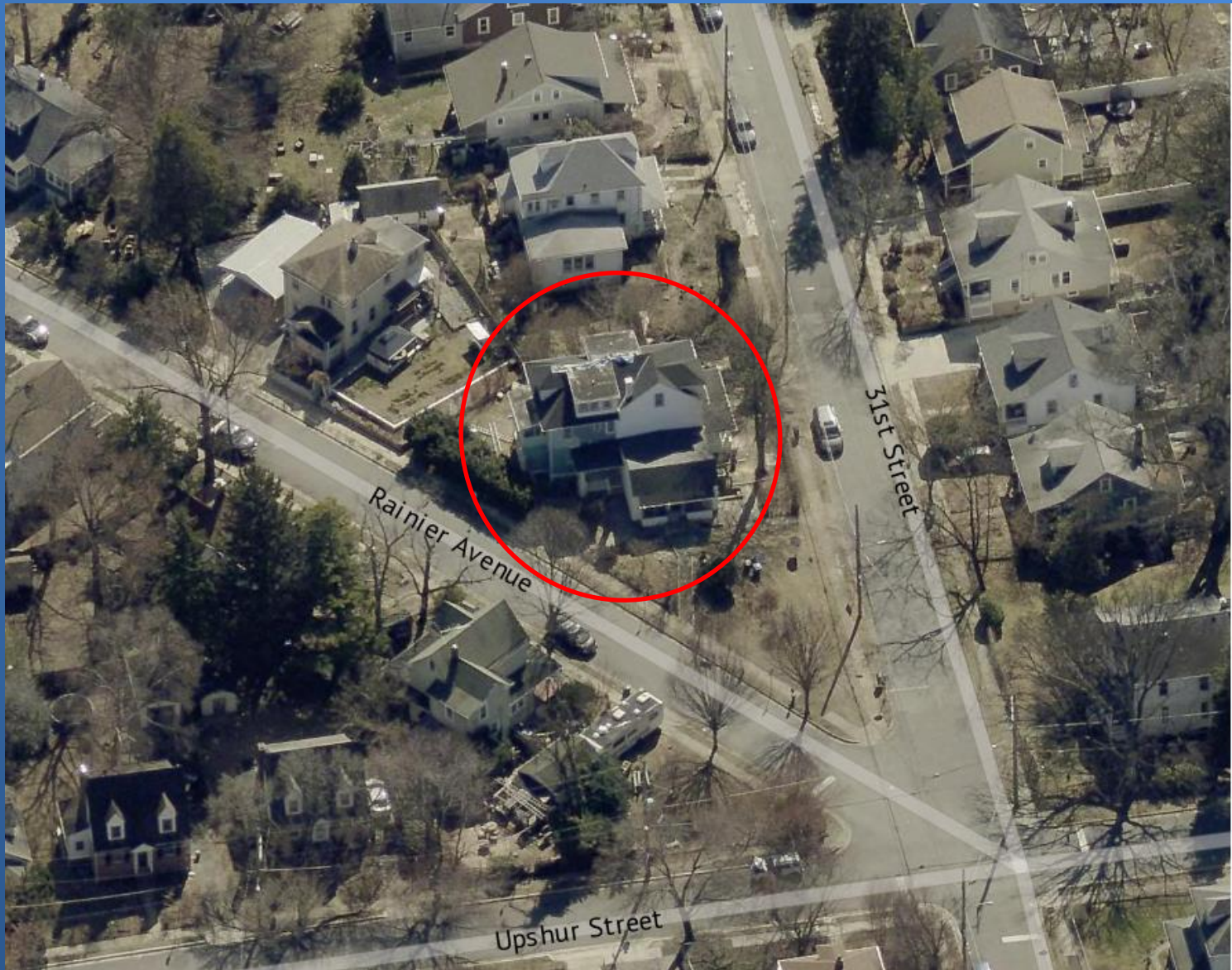
Weinstein House/Harry's Market Oblique aerial view, April 2026