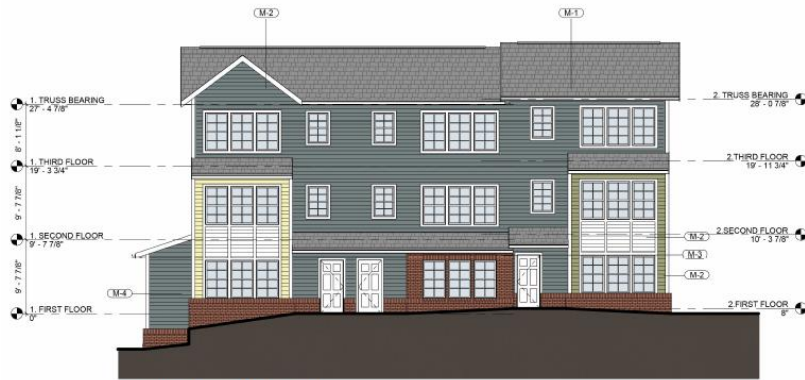
1 SOUTH ELEVATION 1/8" = 1'-0"