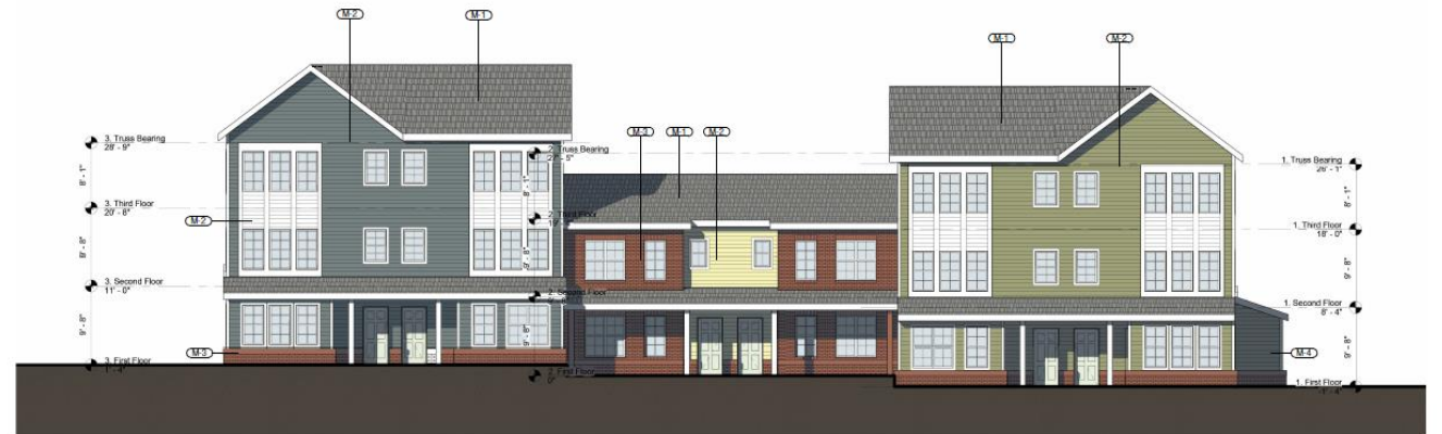
1 EAST ELEVATION 1/8" = 1'-0"