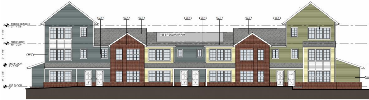
7 SOUTH ELEVATION 1/8" = 1'-0"