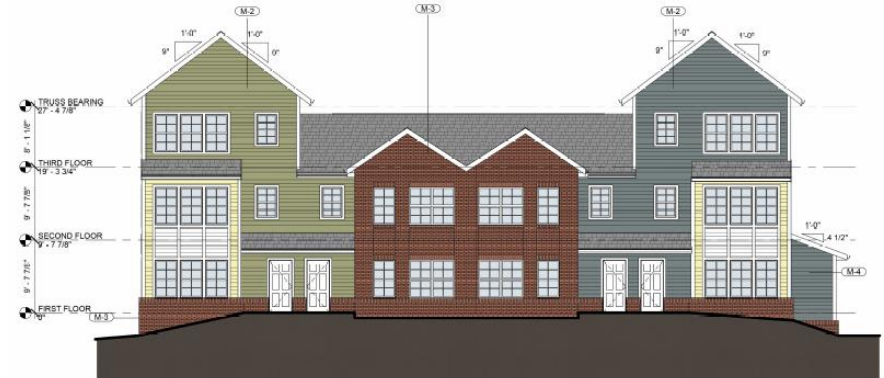
1 SOUTH ELEVATION 1/8" = 1'-0"