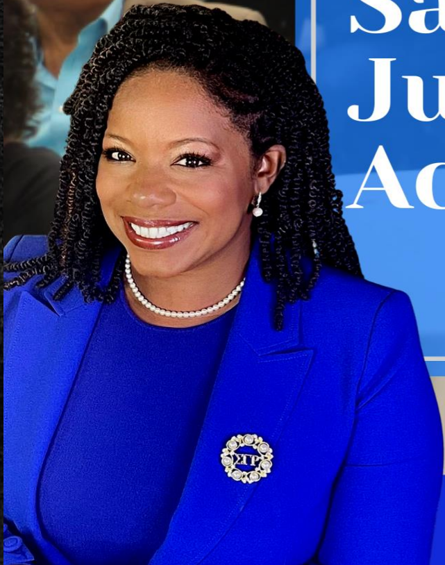
AISHA BRAVEBOY STATE'S ATTORNEY FOR PRINCE GEORGE'S COUNTY