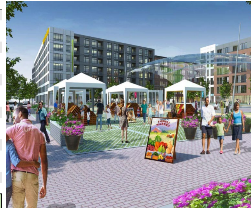
Rendering – Towne Square at Suitland Federal Center