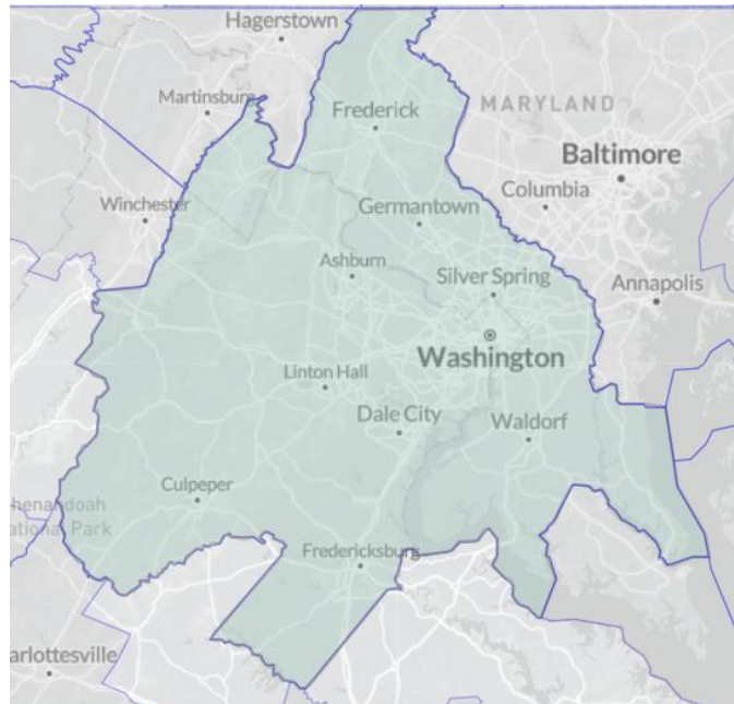
Figure 1: U.S. Census Bureau's DC-VA-MD-WV Metro Area

Affordable housing is a critical issue in an area with rising home values and a lack of housing in general. This project would rehabilitate 100 units at 60% or below of the DMV-regions Area Median Income (AMI). Notably, Prince George’s County’s median household income is already well below the area median, as defined by the U.S. Census Bureau. According to the American Community Survey, the median income for the “Washington-Arlington-Alexandria, DC-VA-MD-WV Metro Area” is $110,355 11 and the median income for Prince George’s County is $90,182. 12 The County median household income, therefore, is already 81.7% of the Area Median Household Income (AMI).