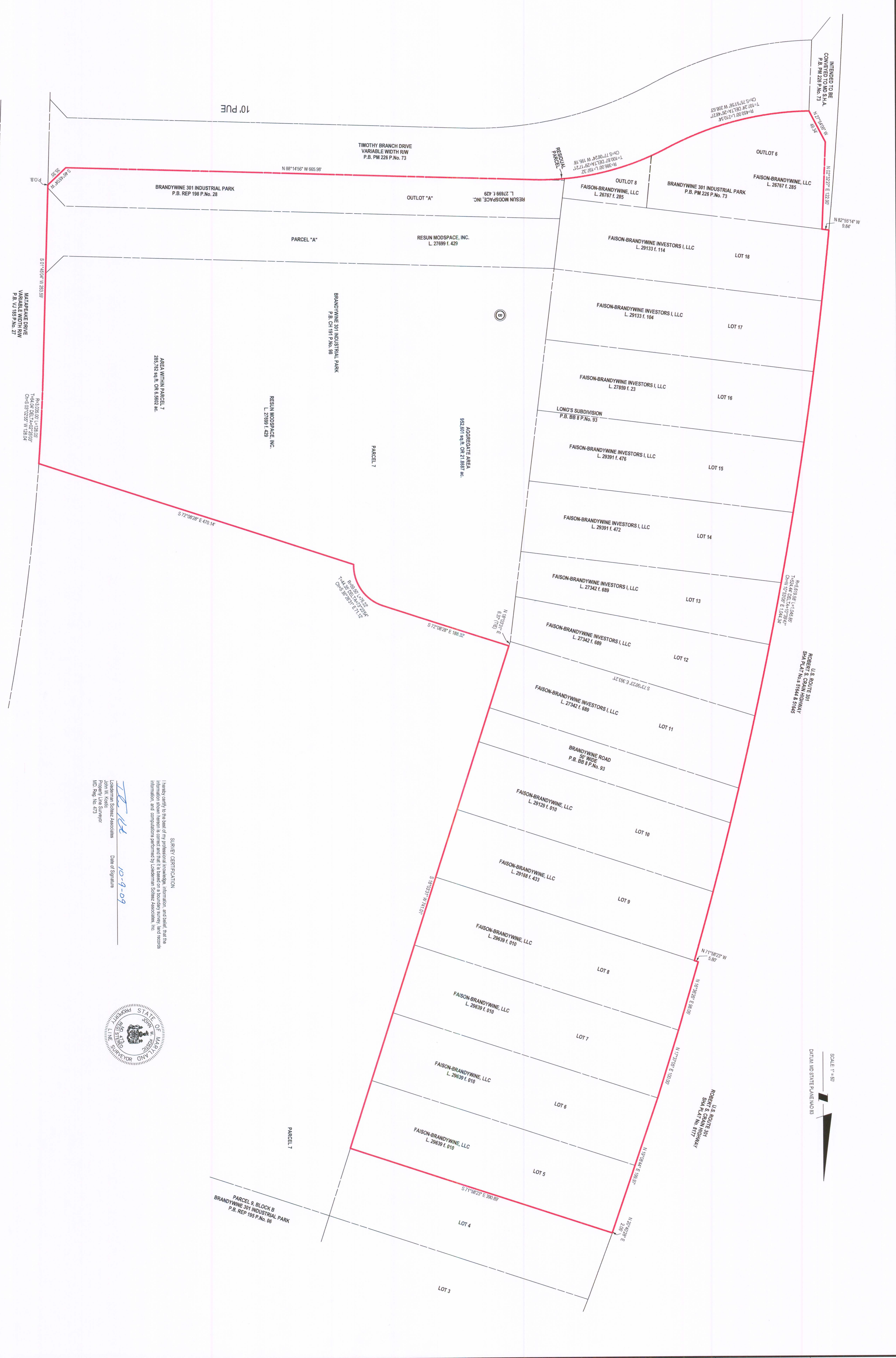
EXHIBIT PIO PARCEL 7, PARCEL A, OUTLOT 8 & 9 AND RESIDUAL PARCEL, BLOCK B BRANDYWINE 301 INDUSTRIAL PARK BRANDYWINE 301 INDUSTRIAL PARK LONG'S SUBDIVISION TAX INCREMENTAL DISTRICT