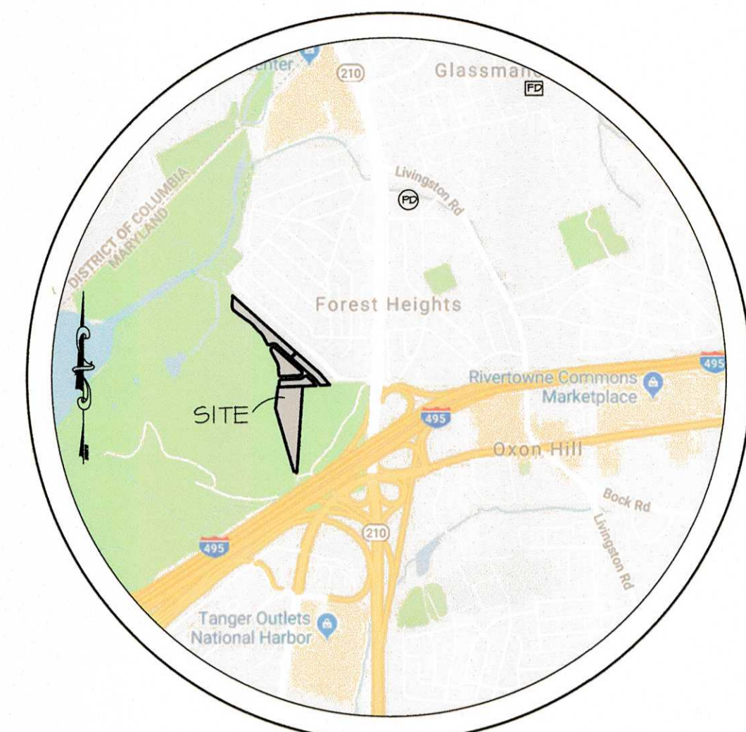
VICINITY MAP N.T.S.