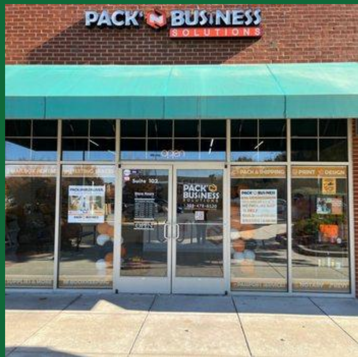
Pack N Businesses DISTRICT 5