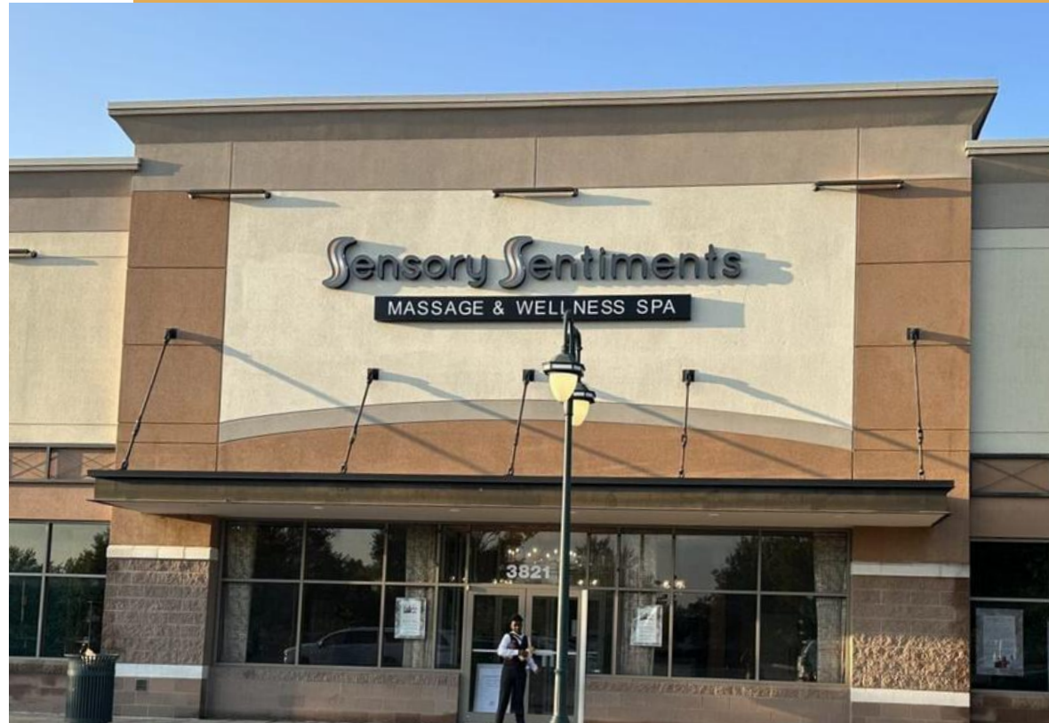
SENSORY SENTIMENTS DISTRICT 4