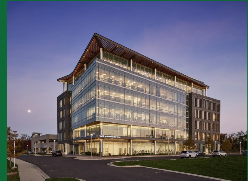
Hampton Park Project DISTRICT 7