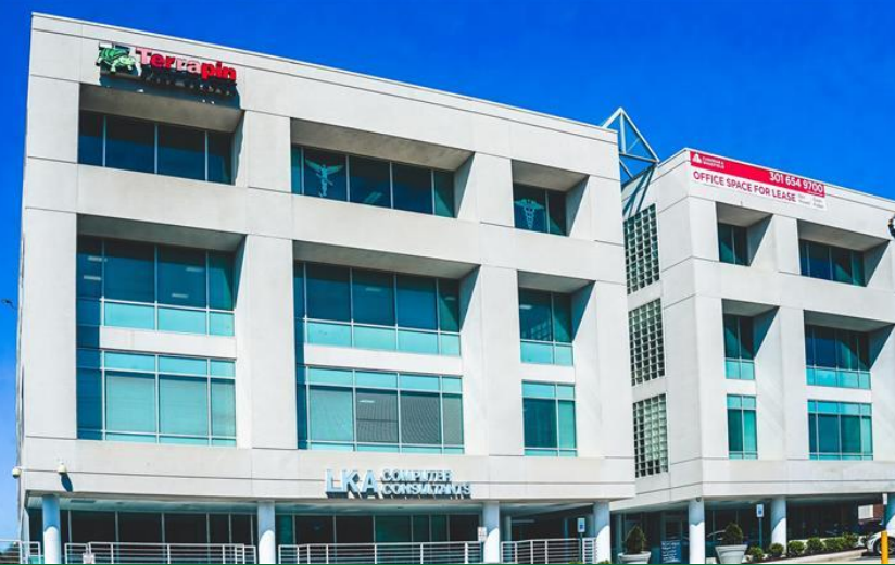
Terrapin Care Center DISTRICT 1