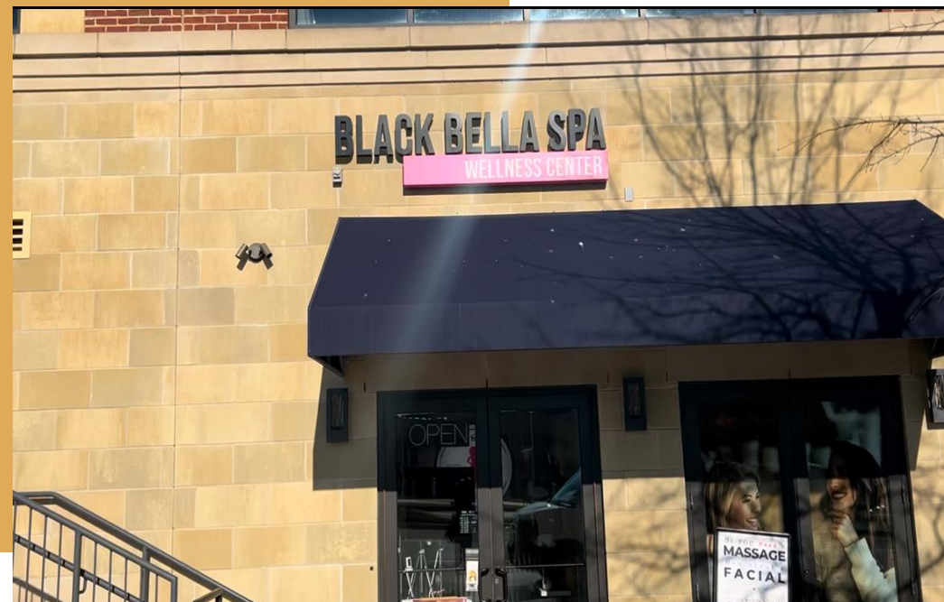
Black Bella Spa DISTRICT 3