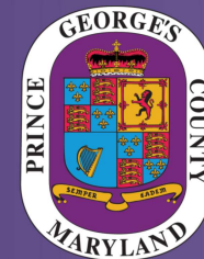
Aisha N. Braveboy