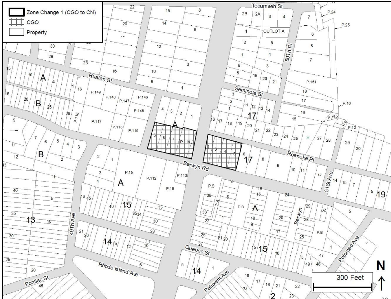
Map 1: Zoning Change (ZC) 1: CGO to CN