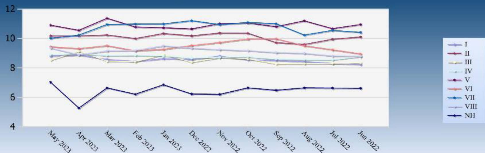
Average Response Times by Division