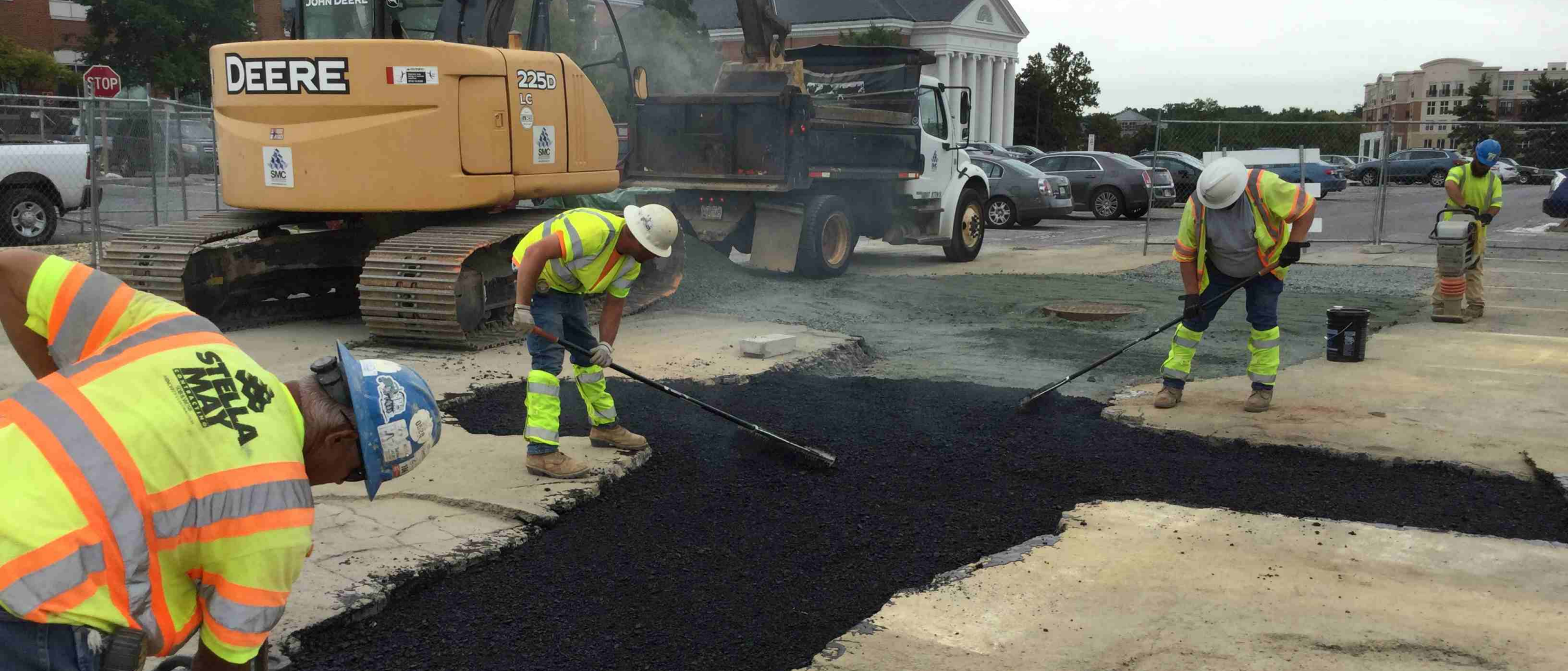
U602 Medco Electric Relocation – Campus Drive Week Ending 09-18-20