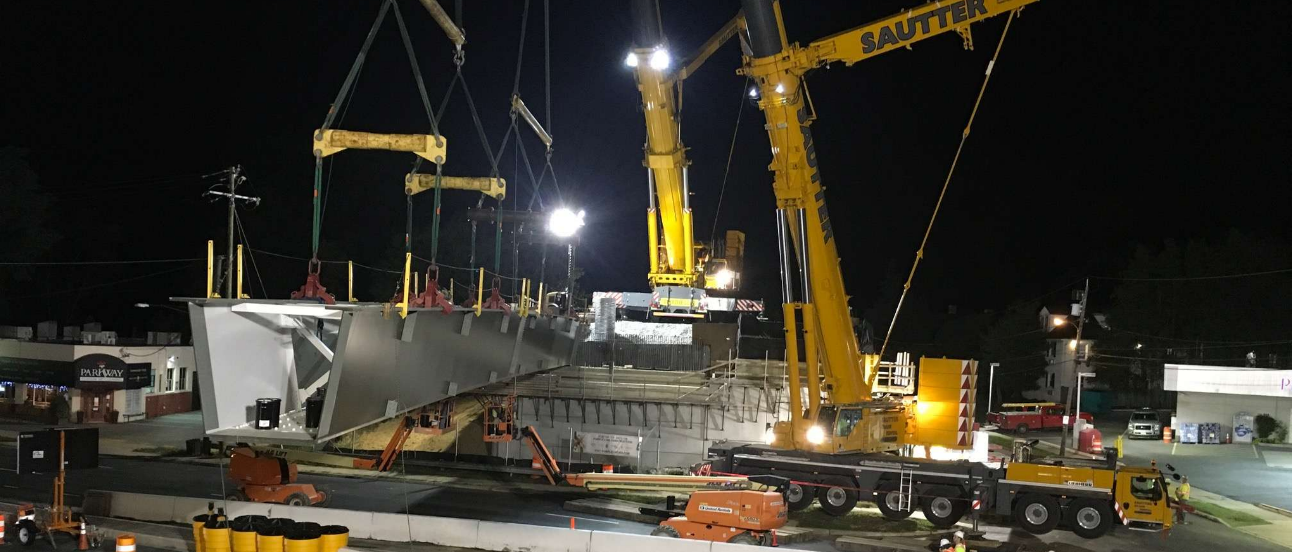
S06 Girder Erection – GBT at Connecticut Avenue Week Ending 09-18-20