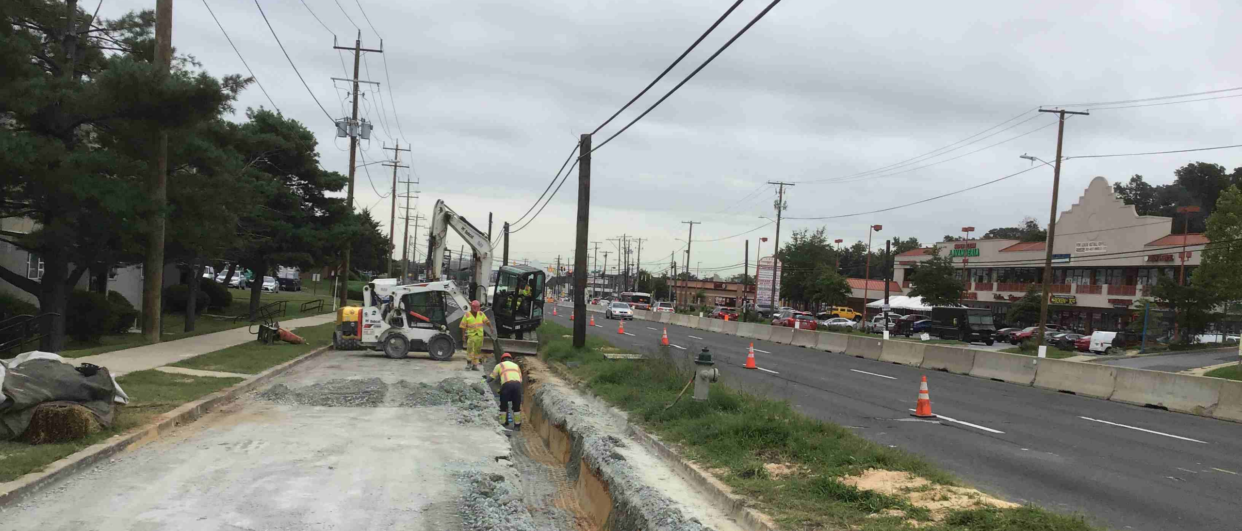
U503 Water Main Relocation – University Boulevard Week Ending 09-18-20