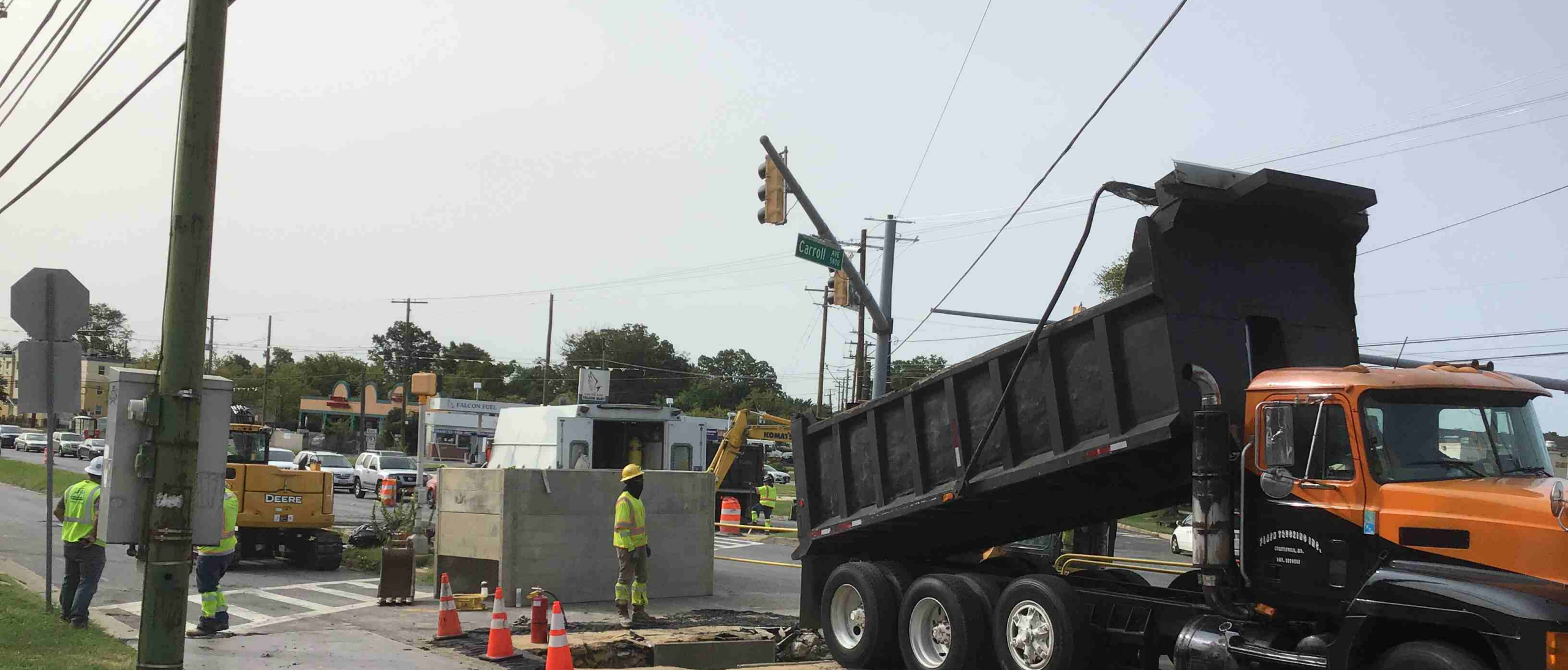
U502 Gas Main Relocation – University Boulevard Week Ending 09-18-20