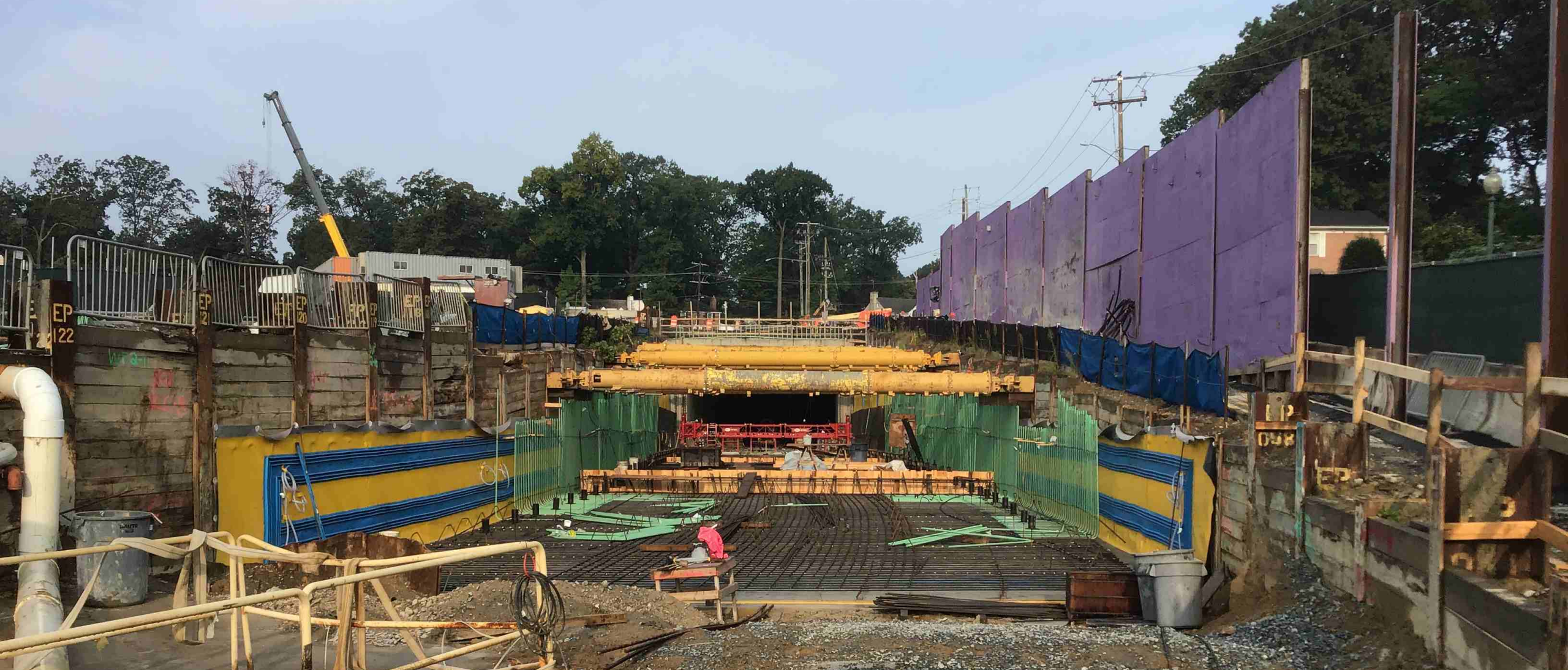
East Cut & Cover Portal – Arliss Street Week Ending 09-18-20