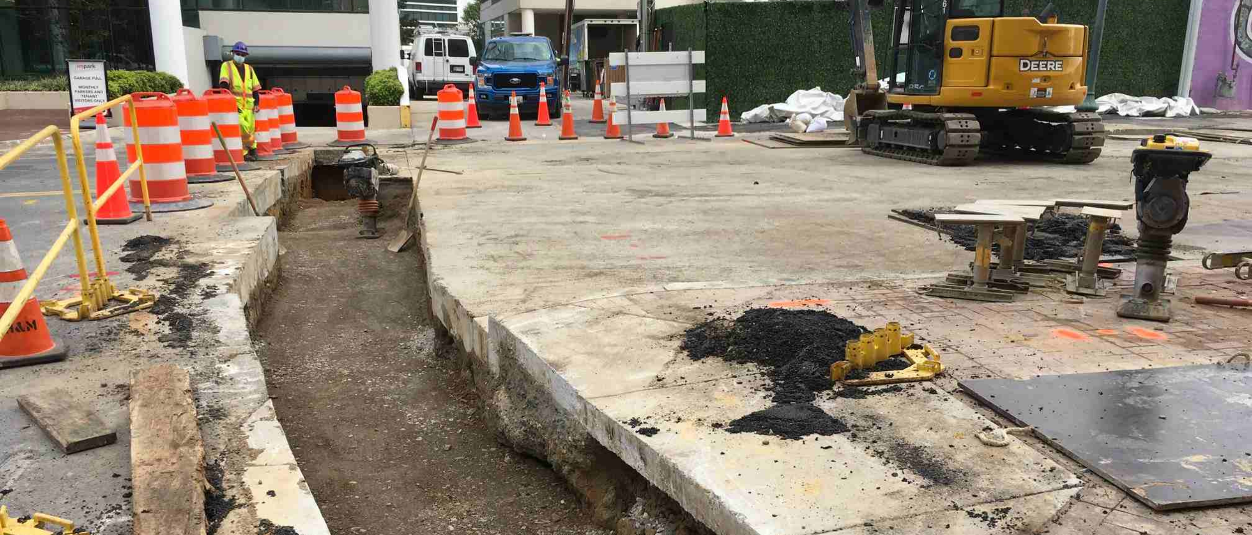
U302 Underground Electric Relocation – Bonifant Street Week Ending 09-18-20