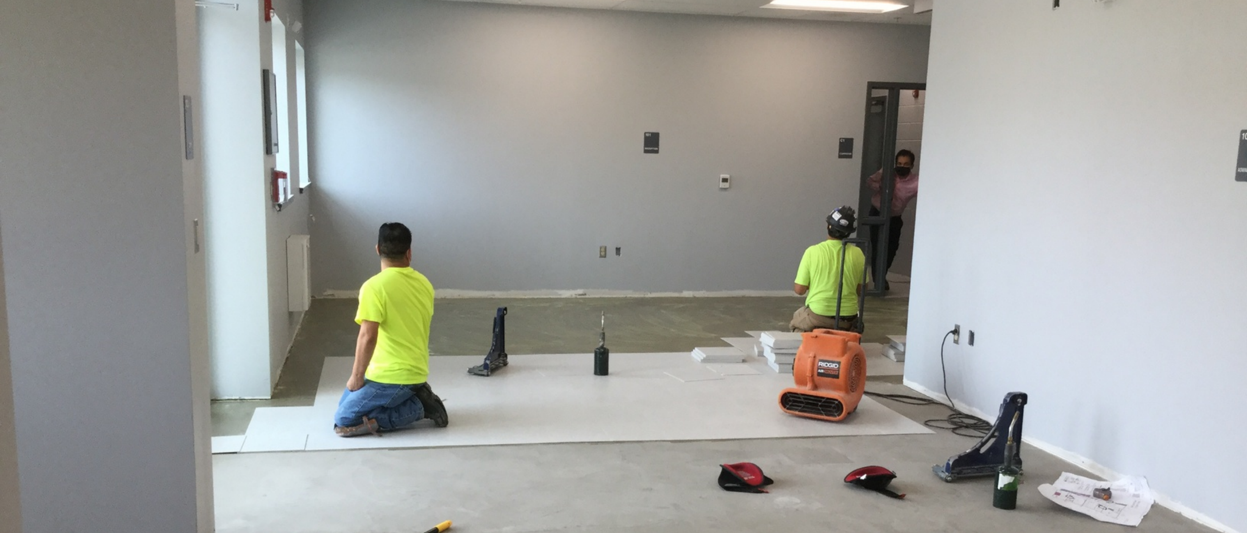
North Building Room 103 Floor Tile Installation – Polk Street Week Ending 09-18-20