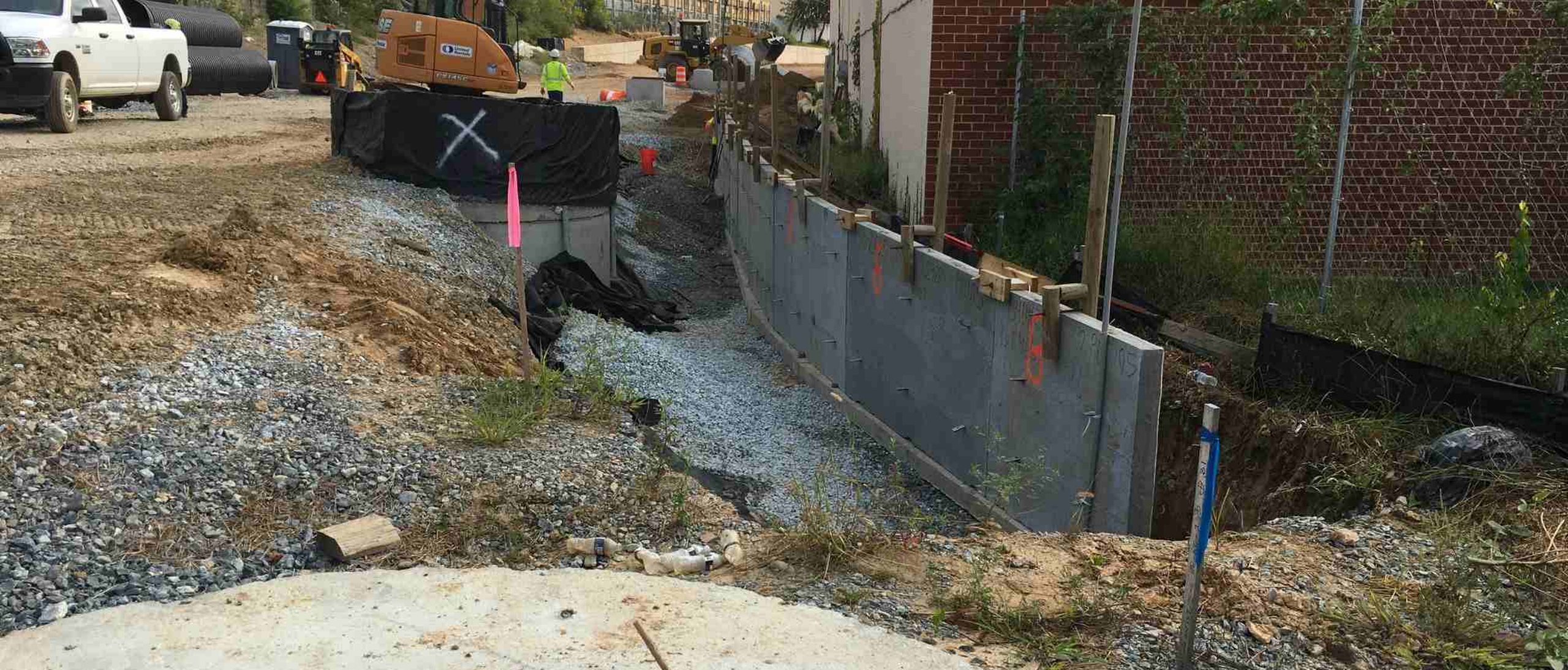
MSE Wall 1-099B Panel Installation – GBT at Stewart Avenue Week Ending 09-18-20