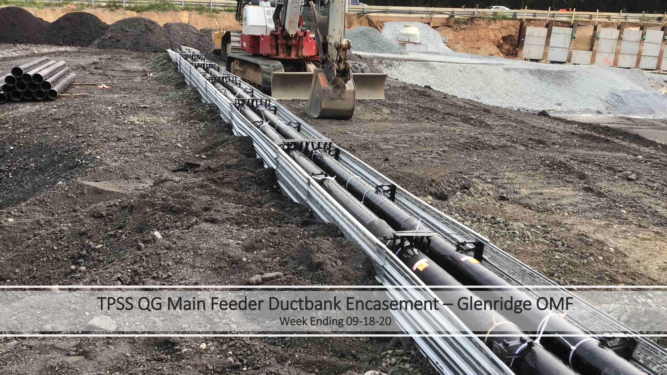
TPSS QG Main Feeder Ductbank Encasement – Glenridge OMF Week Ending 09-18-20