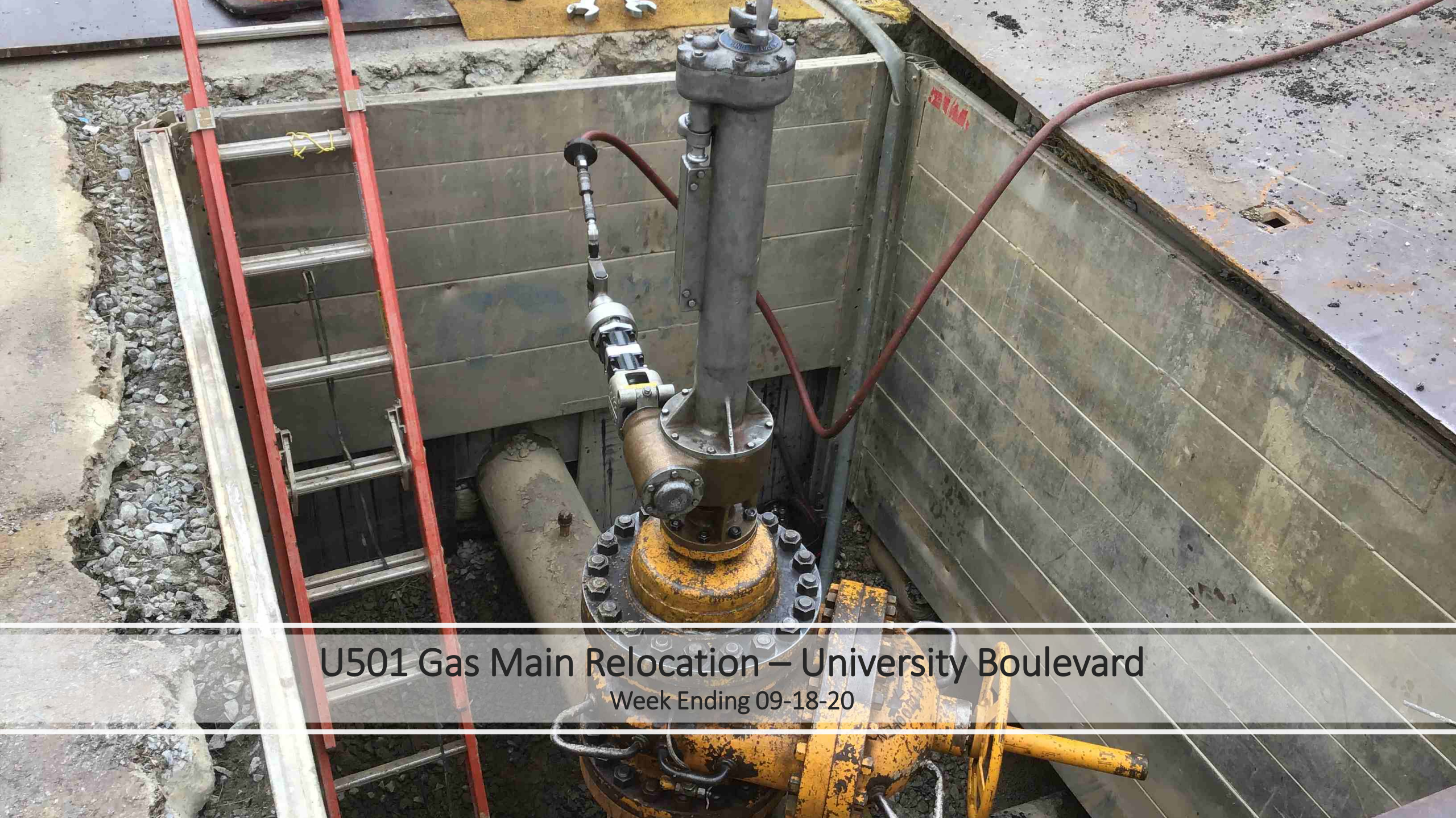
U501 Gas Main Relocation – University Boulevard Week Ending 09-18-20