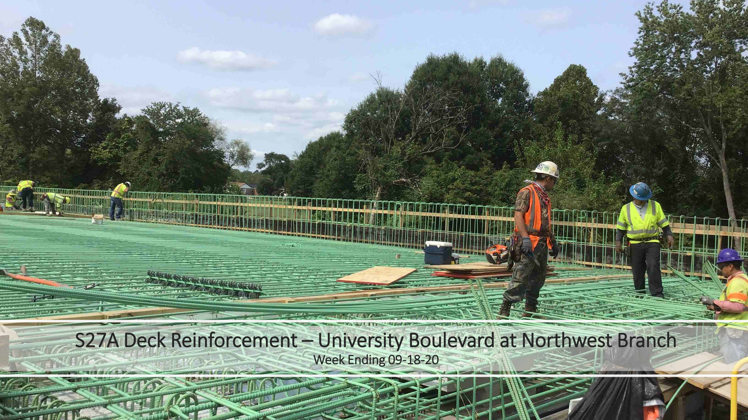
S27A Deck Reinforcement – University Boulevard at Northwest Branch Week Ending 09-18-20