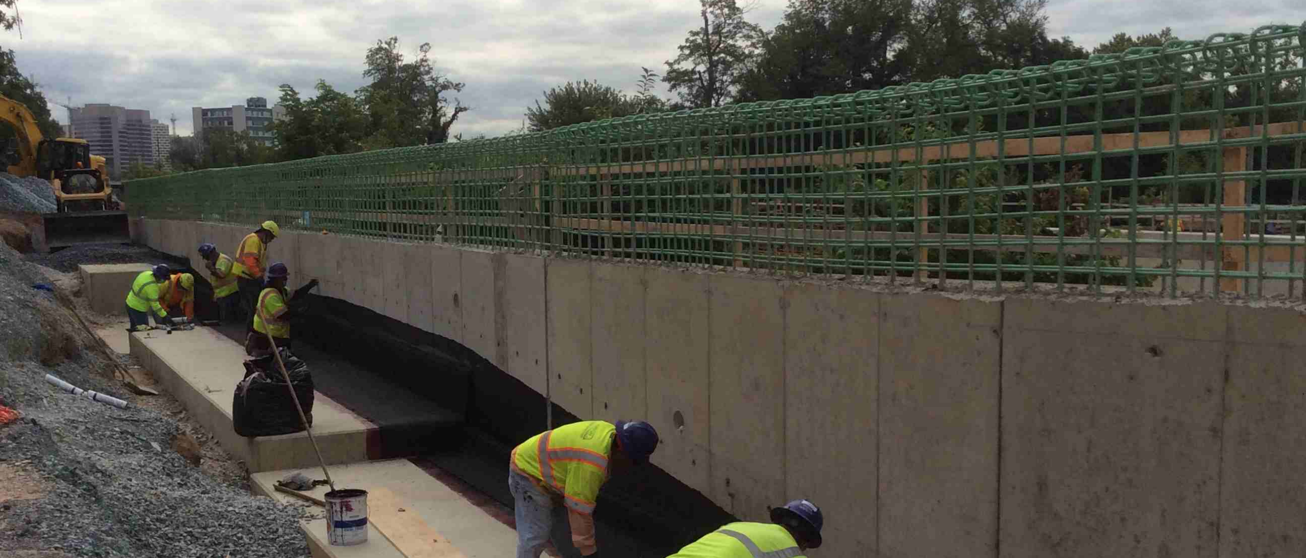
CIP Wall 1-091A Waterproofing – 4 th Avenue Week Ending 09-18-20