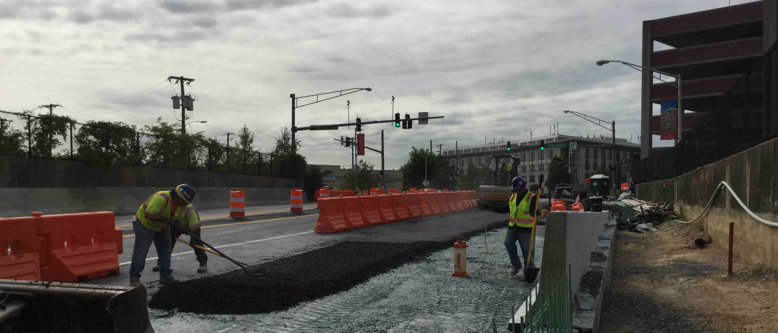
Paving Temporary Pedestrian Walkway – Campus Drive Week Ending 09-18-20