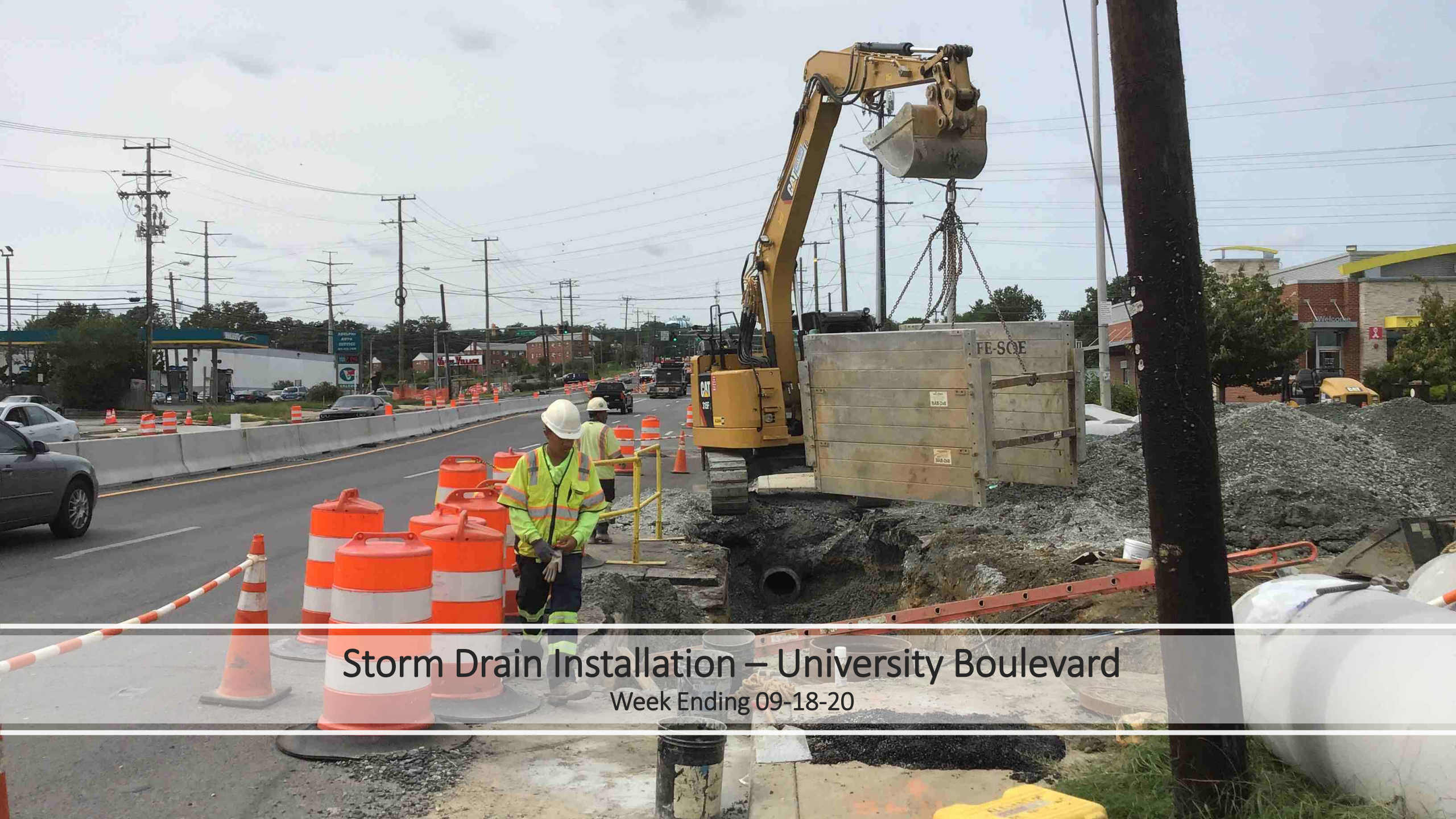
Storm Drain Installation – University Boulevard Week Ending 09-18-20