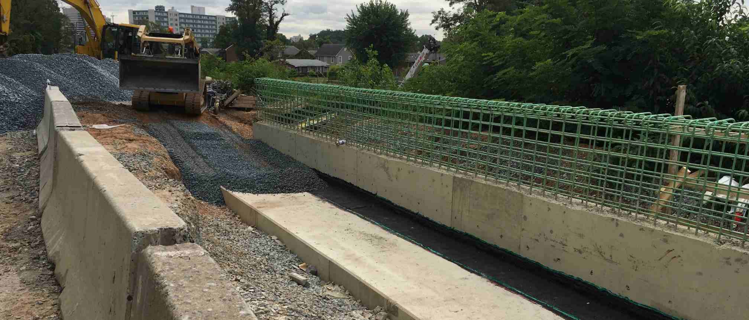
CIP Wall 1-091A Backfill – 4 th Avenue Week Ending 09-18-20