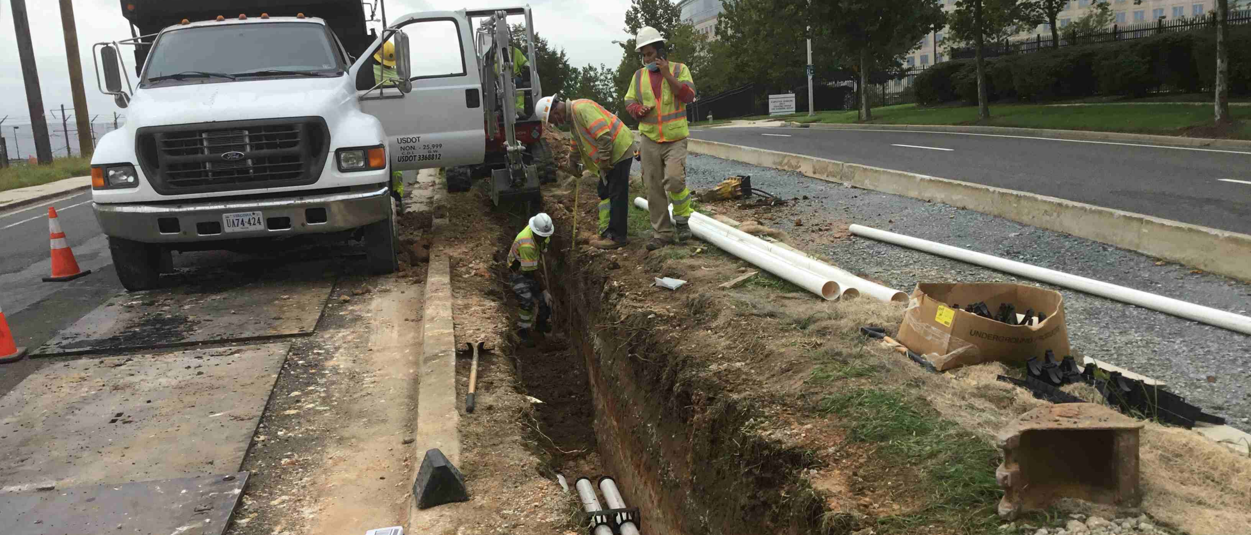
U707 Verizon Relocation – Ellin Road Week Ending 09-18-20