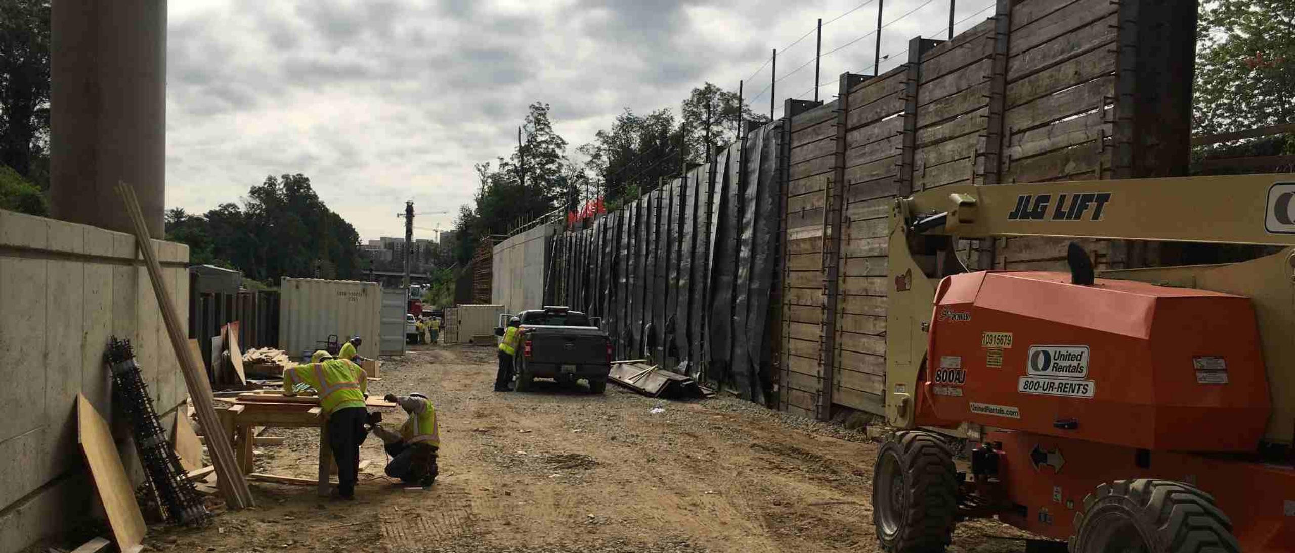
SPL Wall 1-089 – CSX Corridor Week Ending 09-18-20