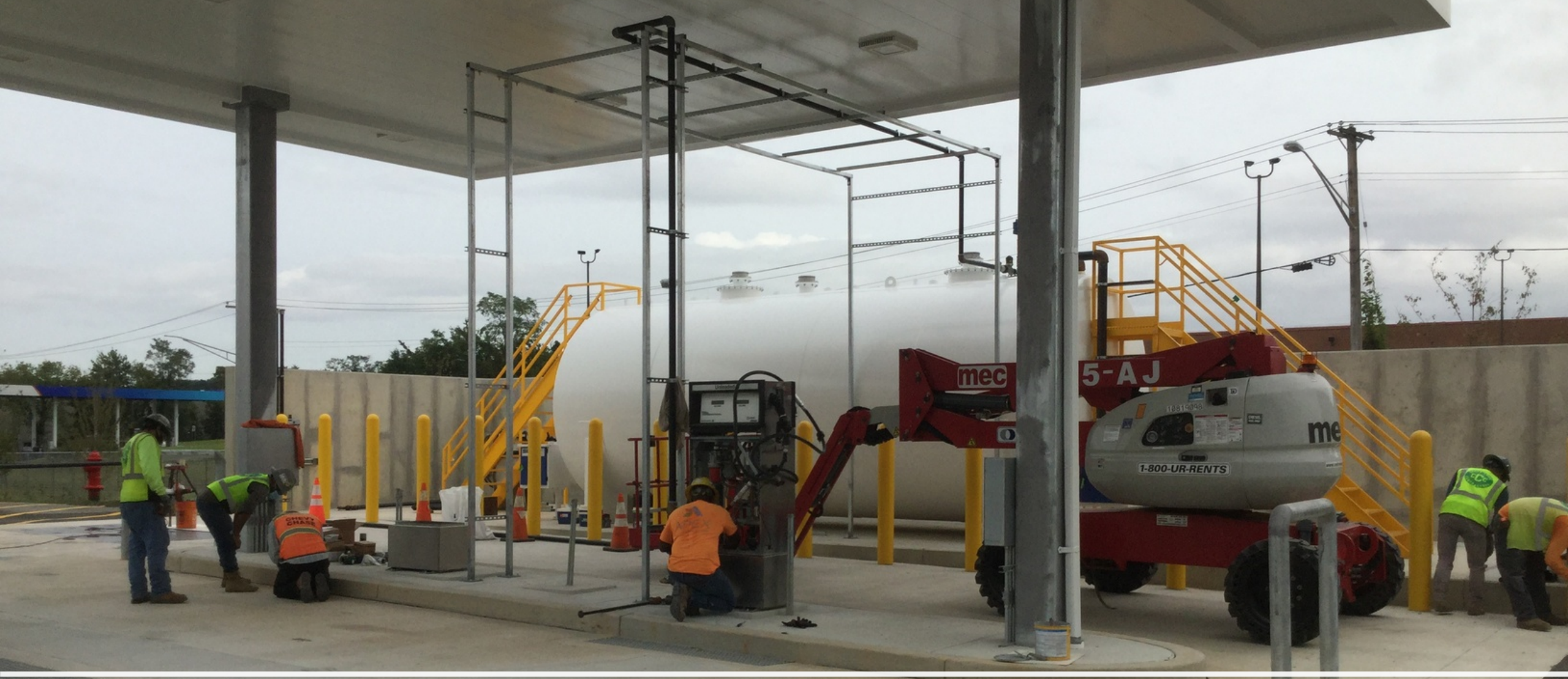
Fuel Tank and Dispenser Installation – Polk Street Week Ending 09-18-20