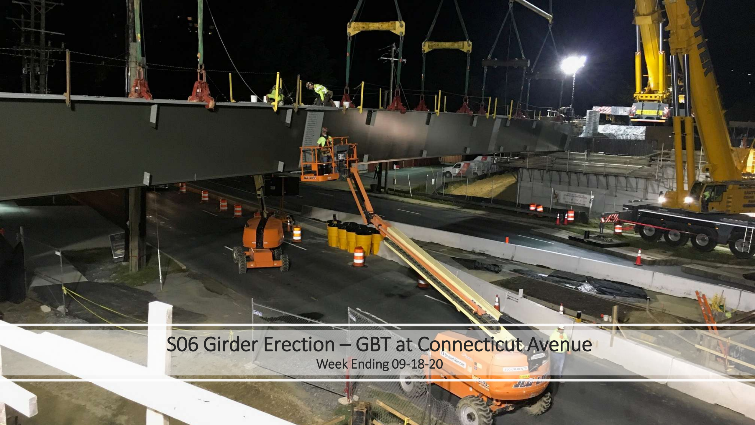
S06 Girder Erection – GBT at Connecticut Avenue Week Ending 09-18-20