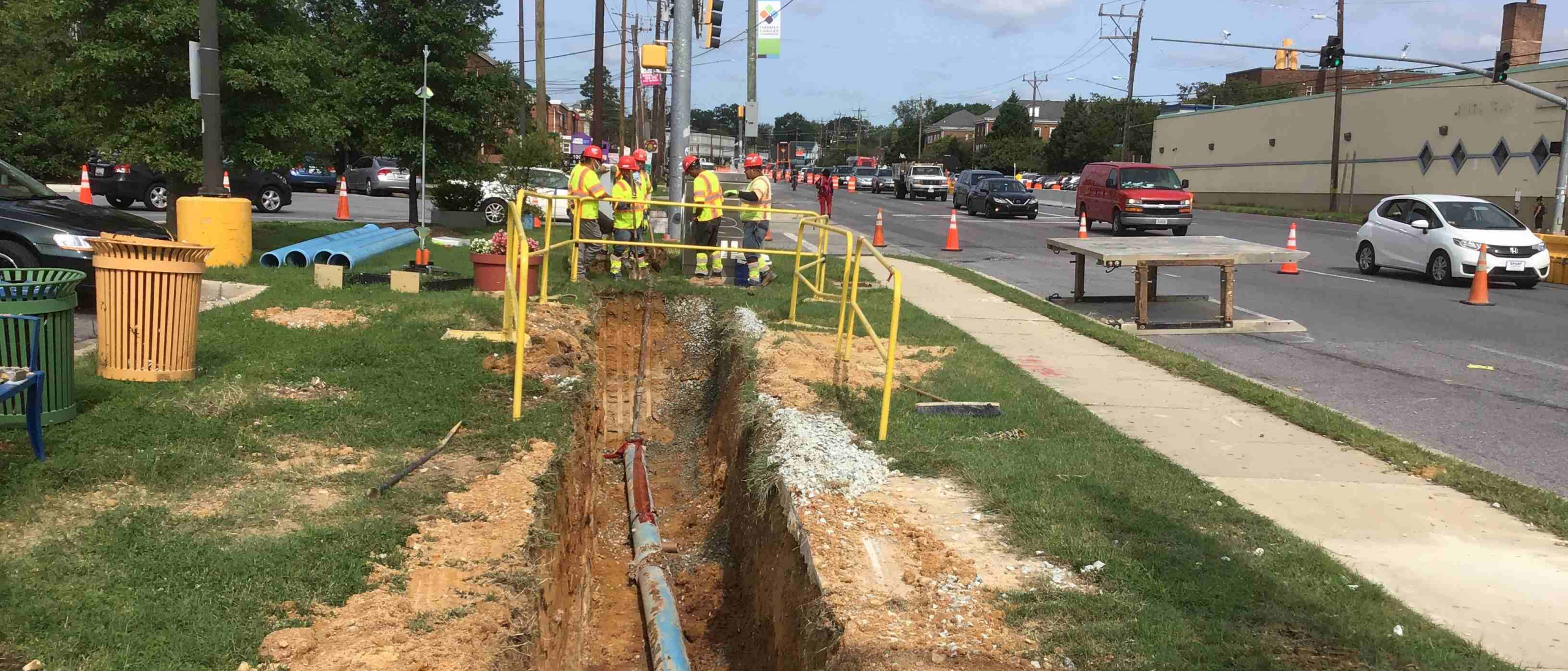
U502 Water Main Relocation – University Boulevard Week Ending 09-18-20