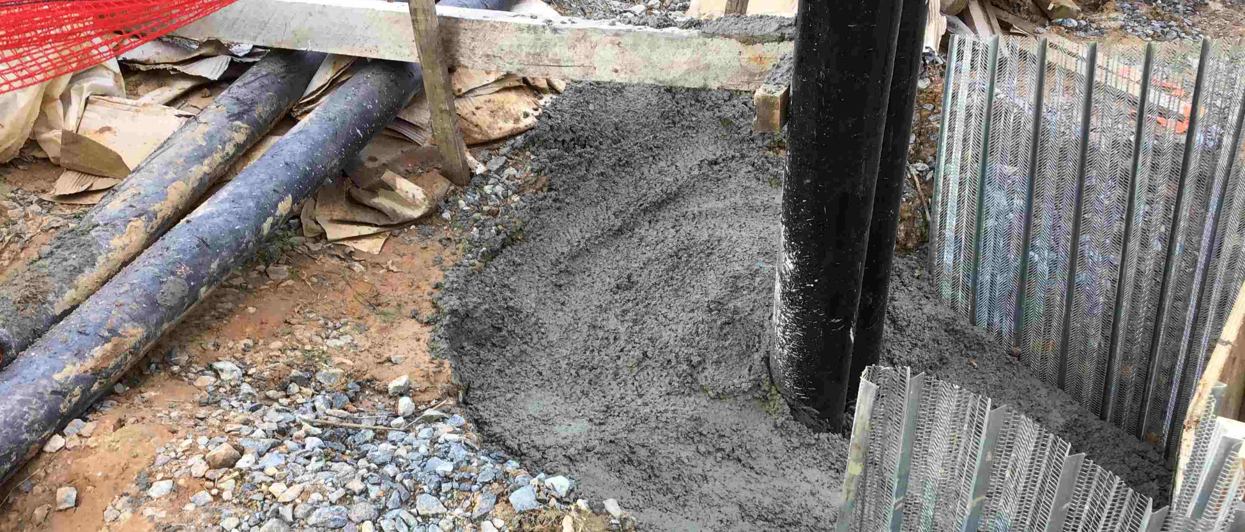
U601 Underground Electric Relocation – Campus Drive Week Ending 09-18-20