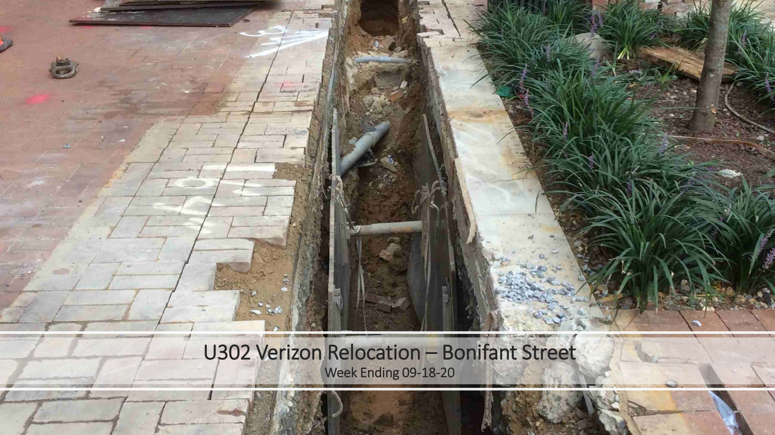
U302 Verizon Relocation – Bonifant Street Week Ending 09-18-20