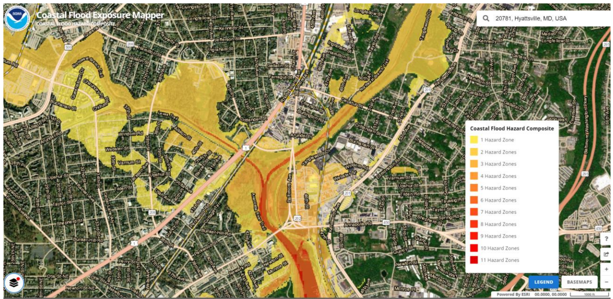
Figure 2 As in Fig. 1, but a wider view with more transparent hazard indications to show underlying land use. Image created on October 2, 2023 from NOAA's Coastal Flood Exposure Mapper.