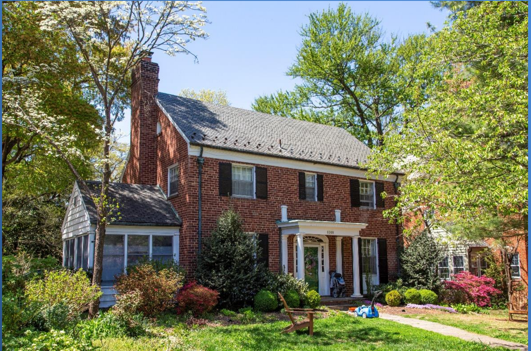
Yates and Mary Boswell House, southeast view, April 2023.