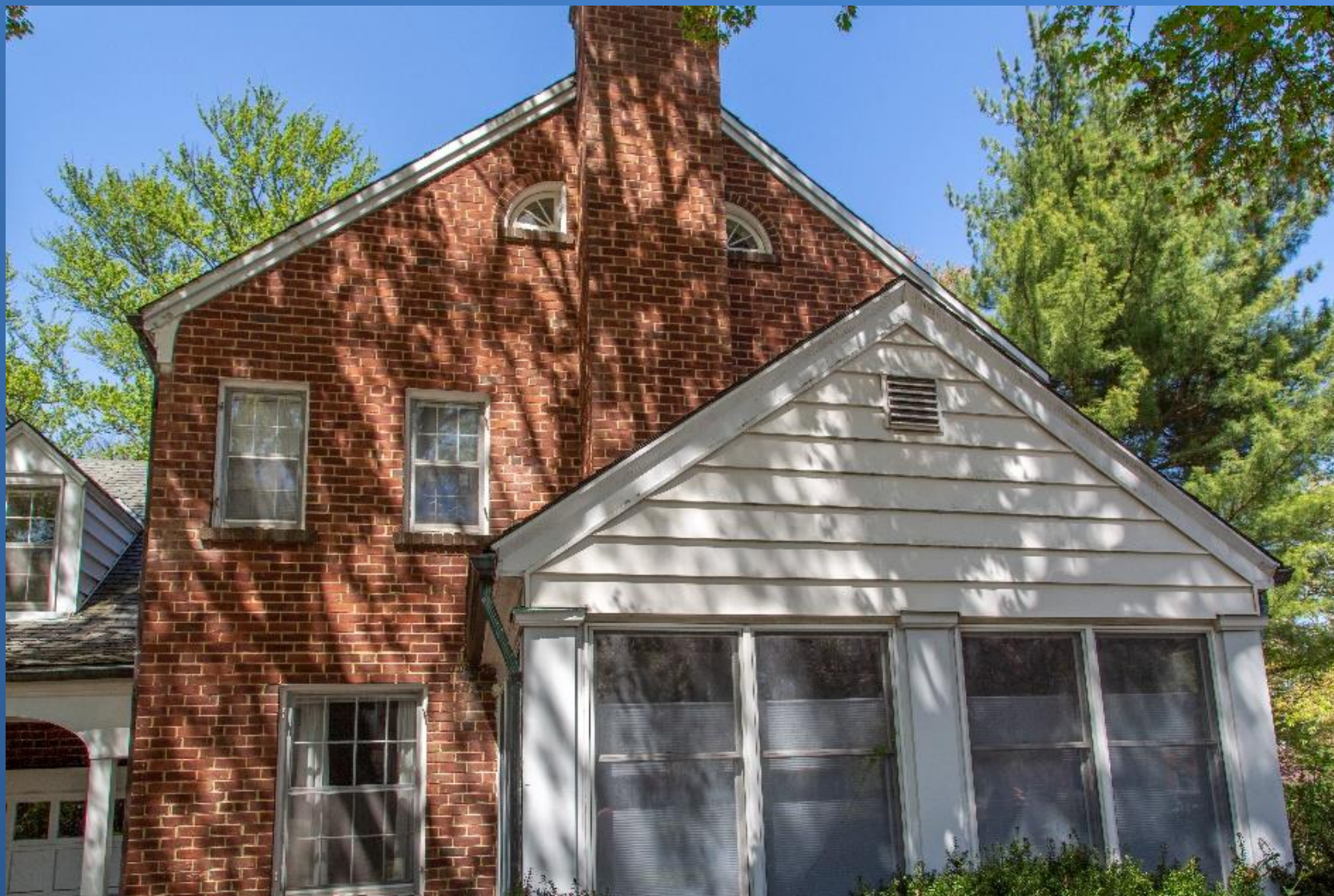
Yates and Mary Boswell House, south elevation, April 2023.