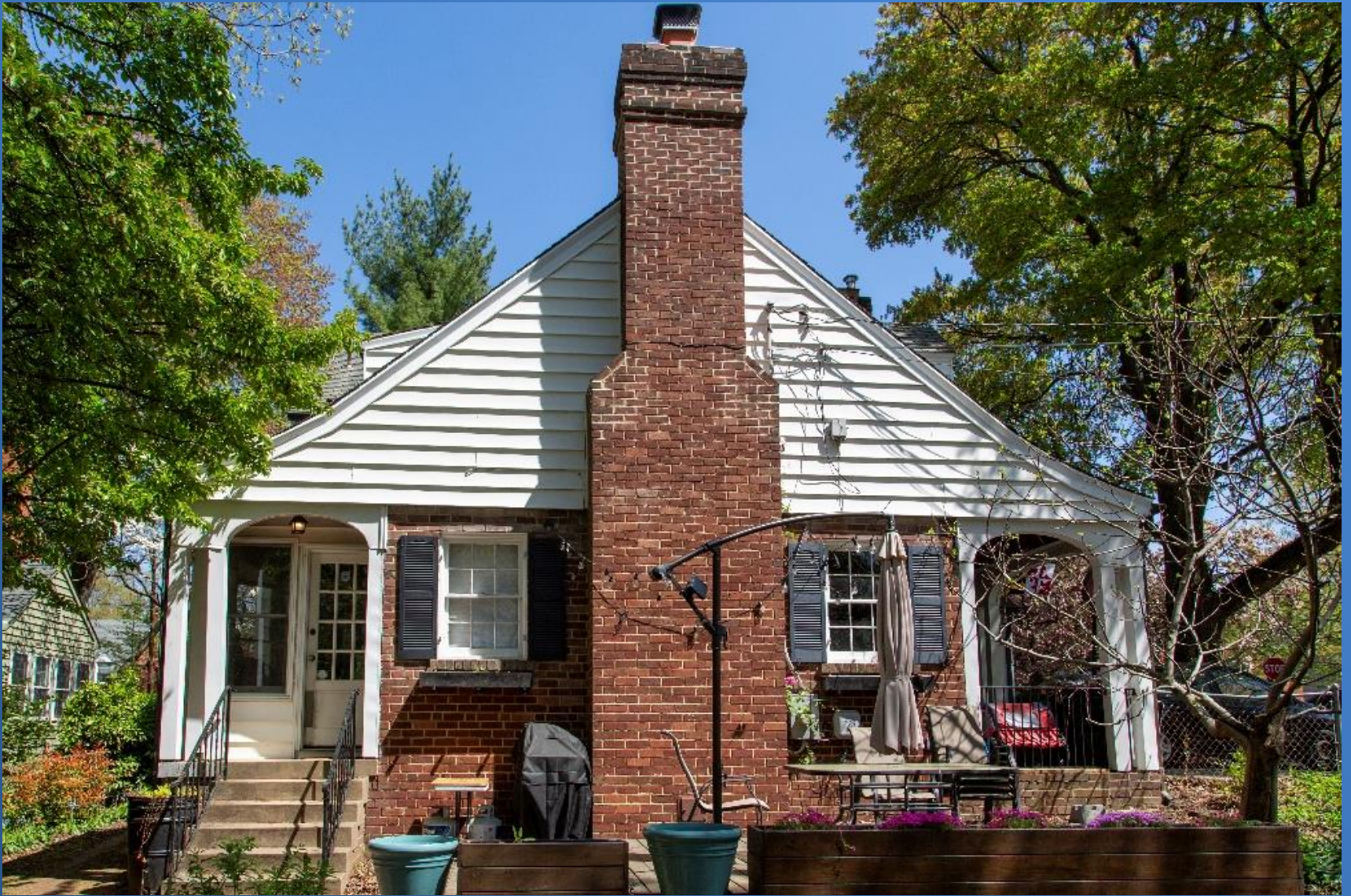
Yates and Mary Boswell House, rear elevation, April 2023.