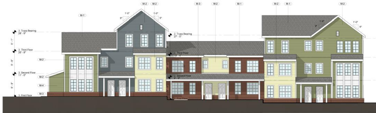
1 NORTH ELEVATION A4.1 1/8" = 1'-0"