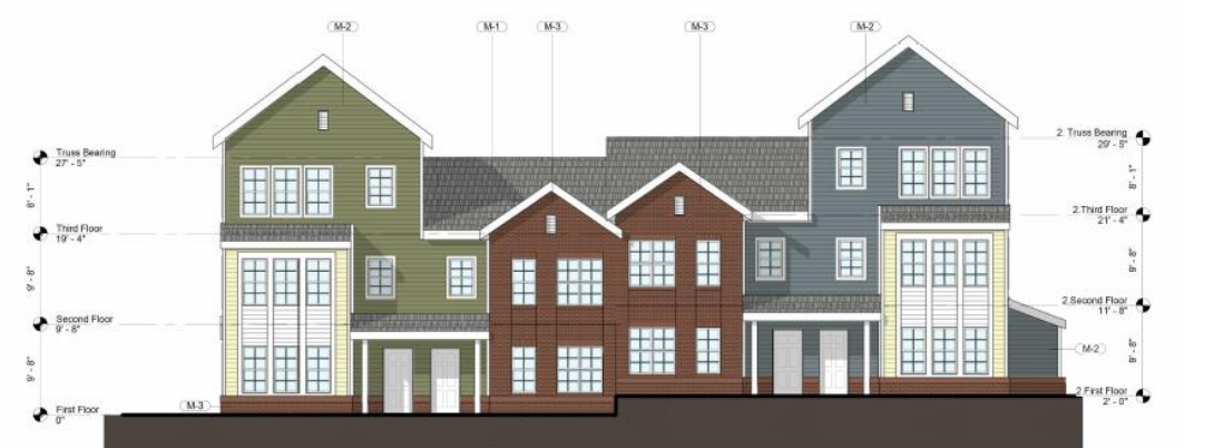
1 SOUTH ELEVATION A4.5 1/8" = 1'-0"