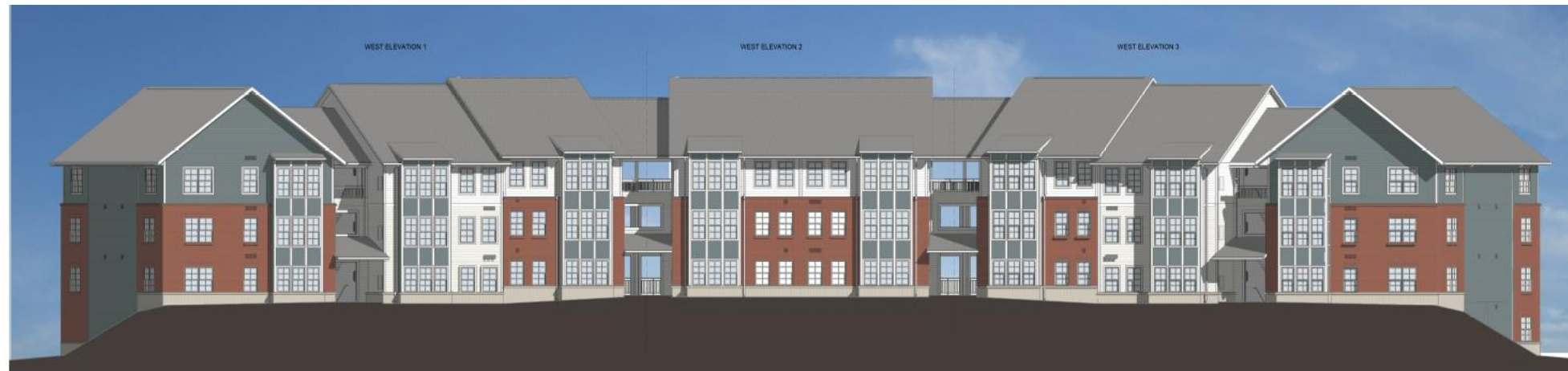
1 WEST ELEVATION OVERALL 25' 0" x 121' 0" = 1:21'