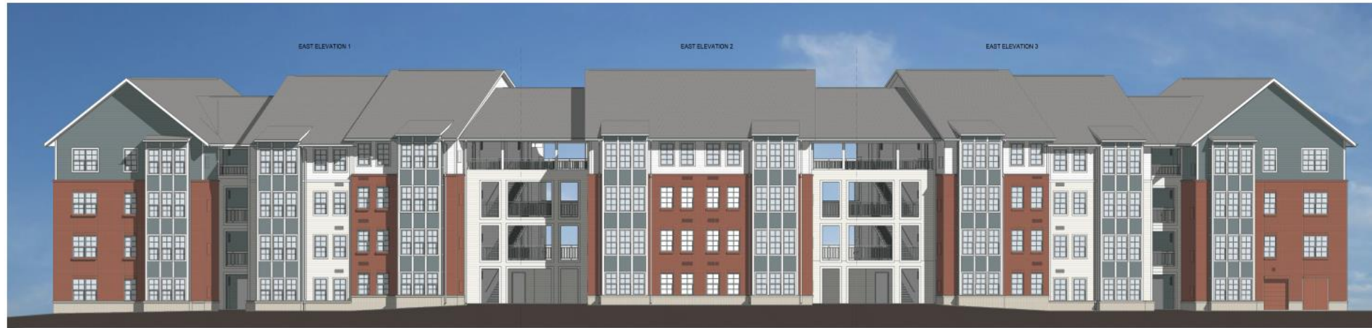
1 EAST ELEVATION OVERALL 25' 0" x 121' 0" = 1:21'