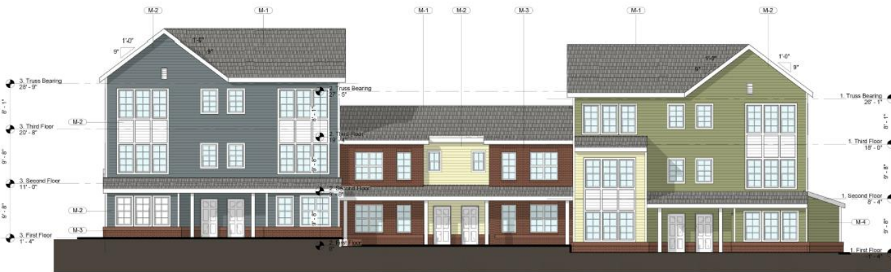
1 EAST ELEVATION A4.4 1/8" = 1'-0"