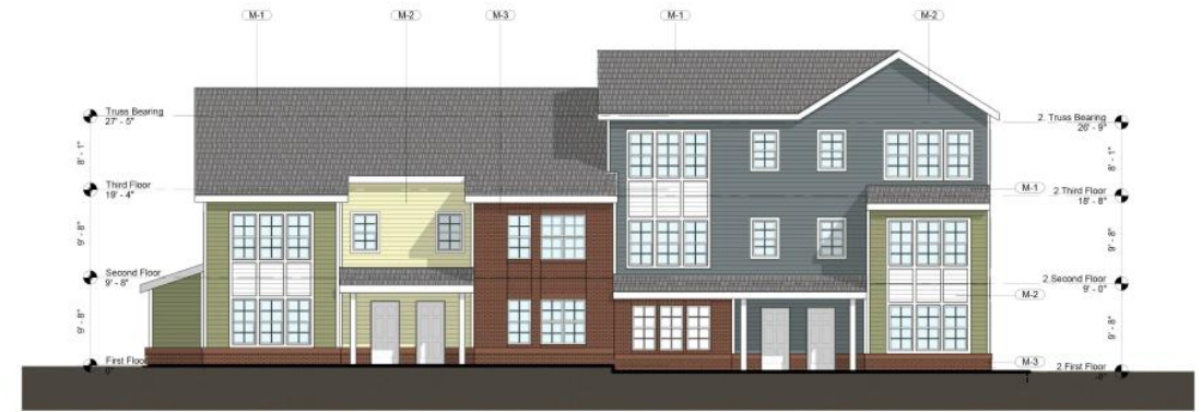
1 NORTH ELEVATION A4.2 1/8" = 1'-0"