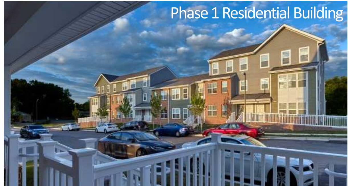
Phase 1 Residential Building