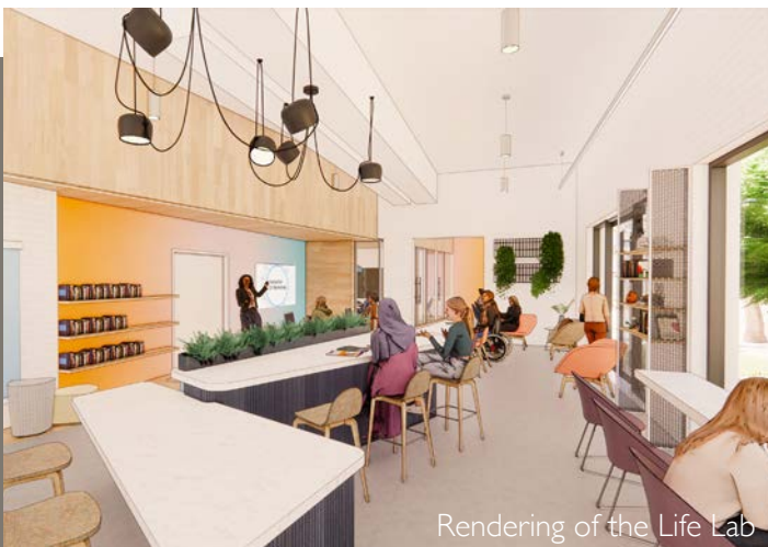
Rendering of the Life Lab

Focus areas: Creative Production, Architecture Design, and Fashion Technology