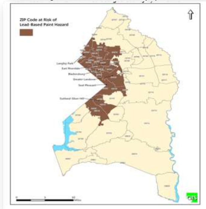
Figure 3 - Lead-Based Paint Risk by Zip Code