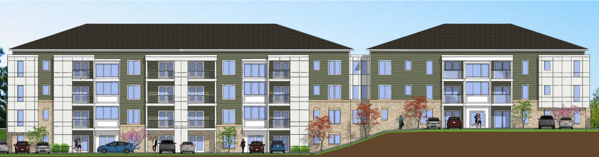
Bldg. 1 & 2