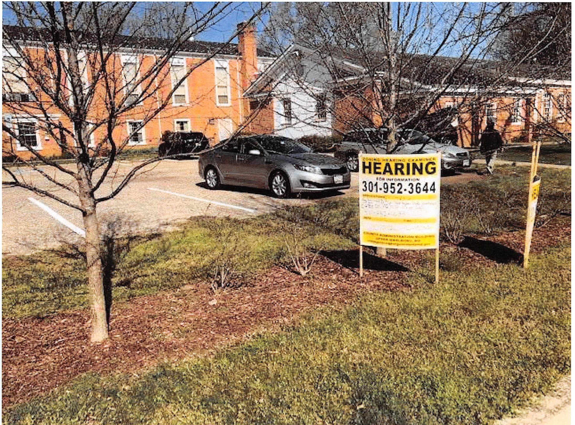
50th Looking North