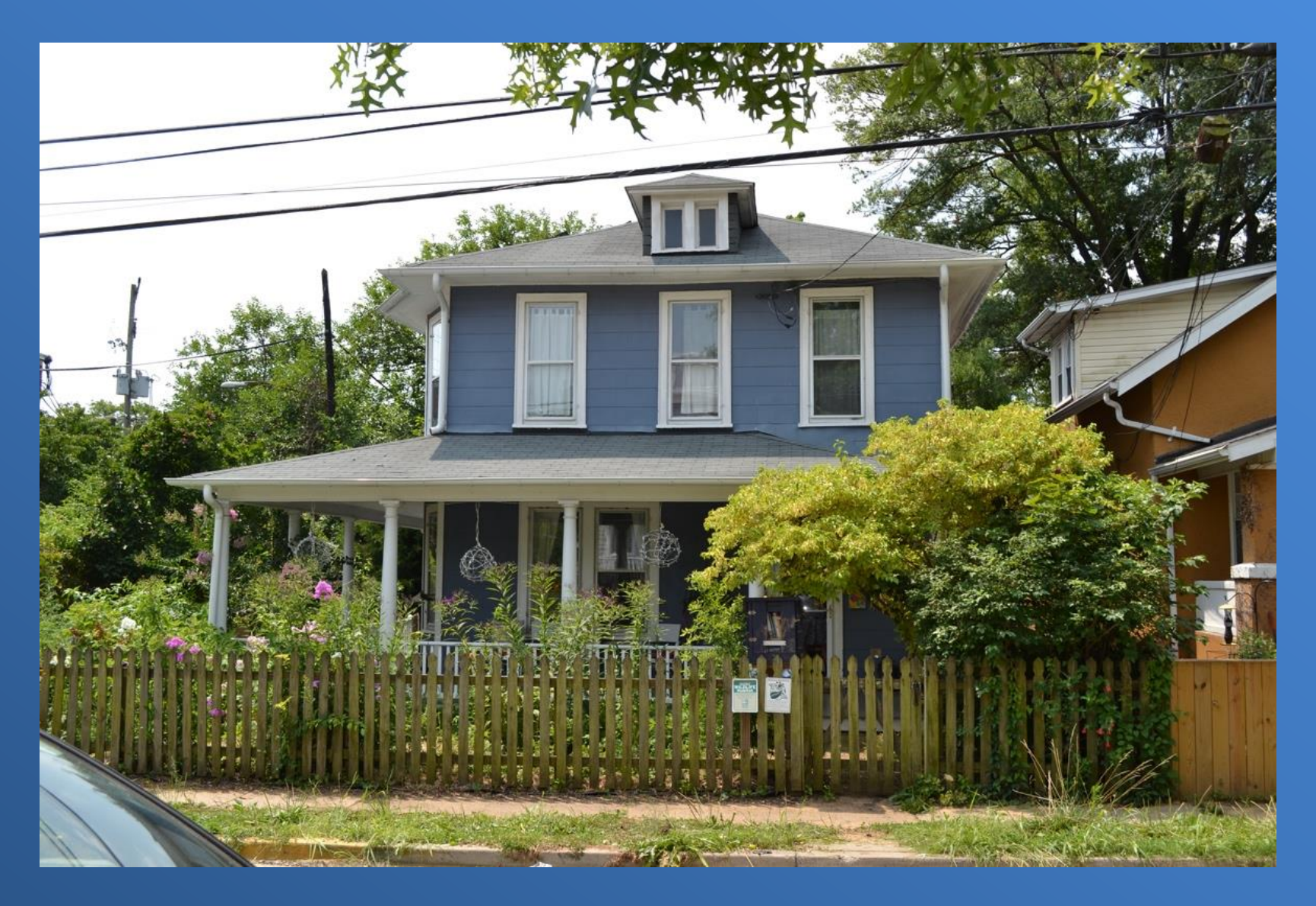
Smith-Israelson House, North Elevation, July 2021