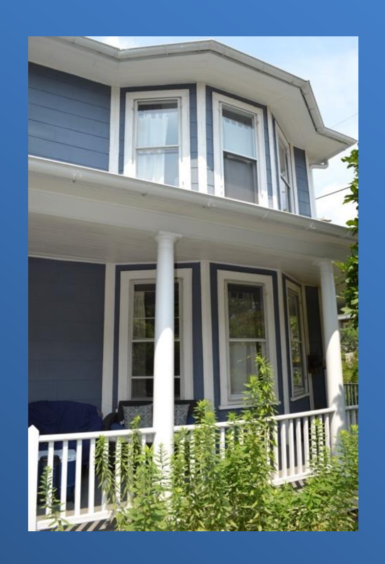
North side of East Elevation