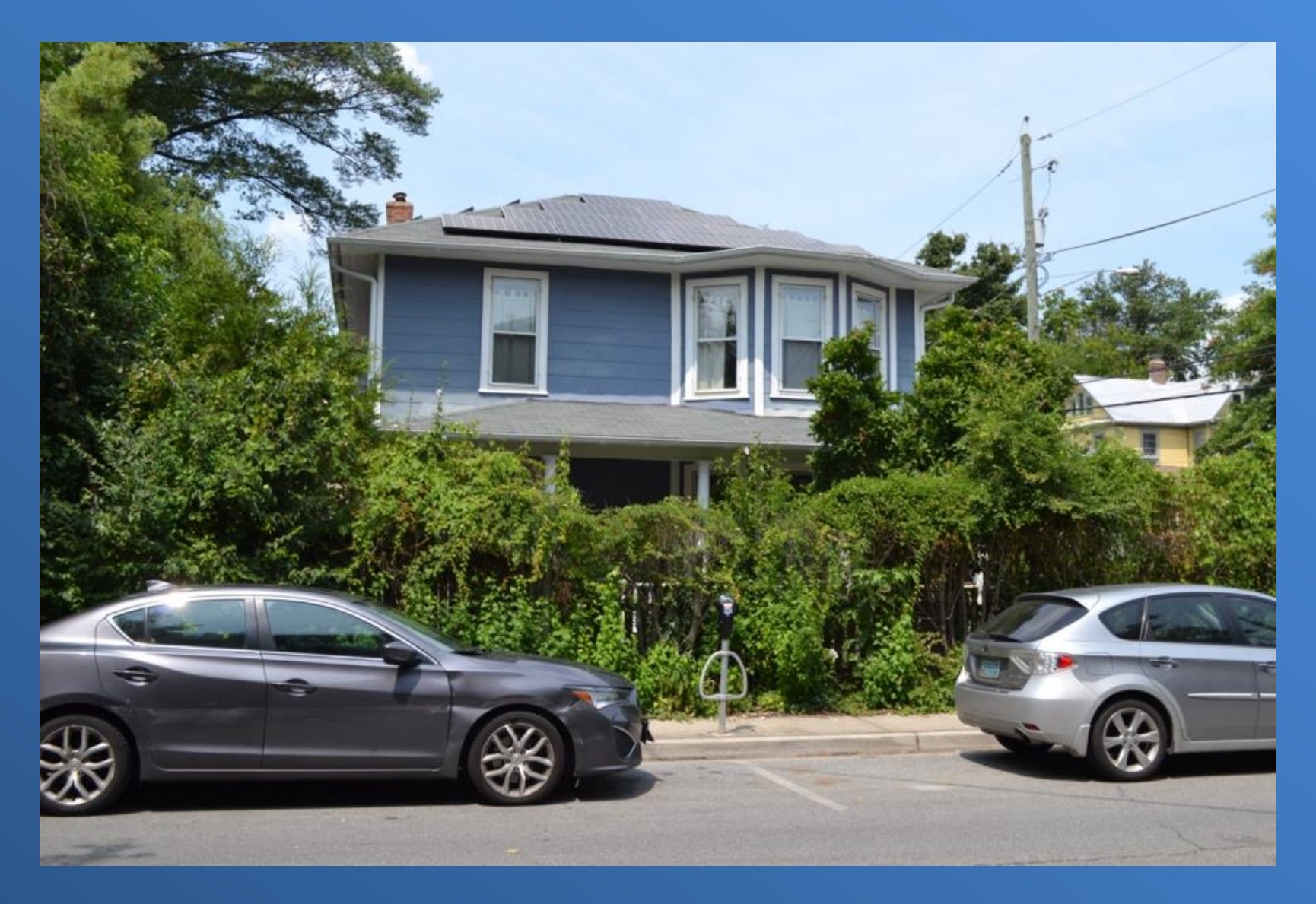
Smith-Israelson House, East Elevation, July 2021