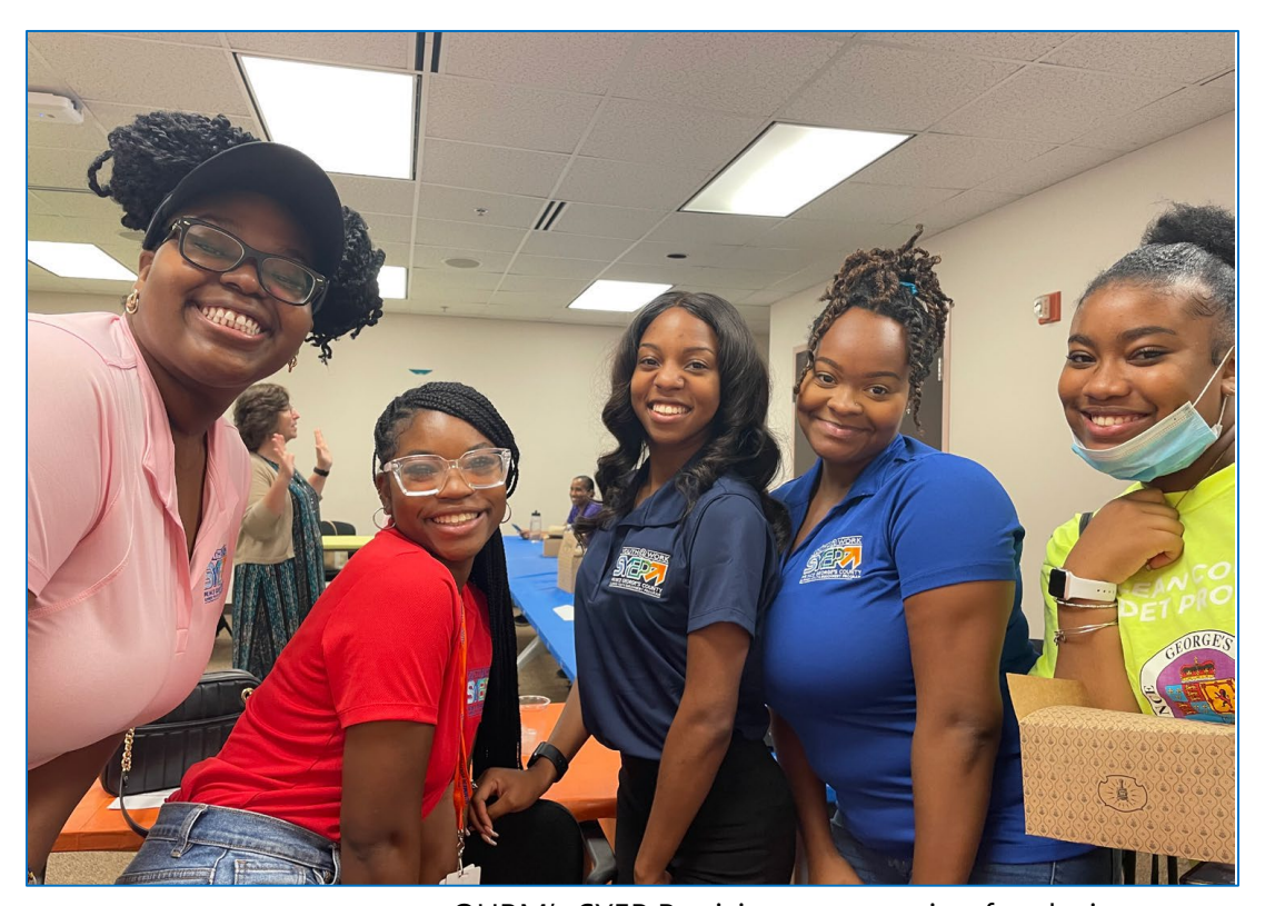
OHRM's SYEP Participants preparing for closing event

Youth Entrepreneur Academy – Teenpreneur Business (virtual) - Participants led productive, successful, and purposeful business enterprises and experienced meaningful business situations that are not only profitable but also serve the people of Prince George's County in an ethical, better business environment. Participants produced a business plan and completed a presentation in front of a panel of experienced professionals, and the top three plans were recognized. Ages 16 and 17