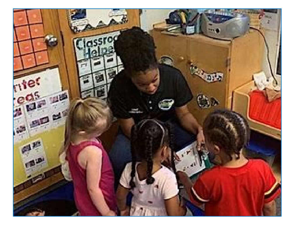
SYEP participant reading to children at County daycare facility