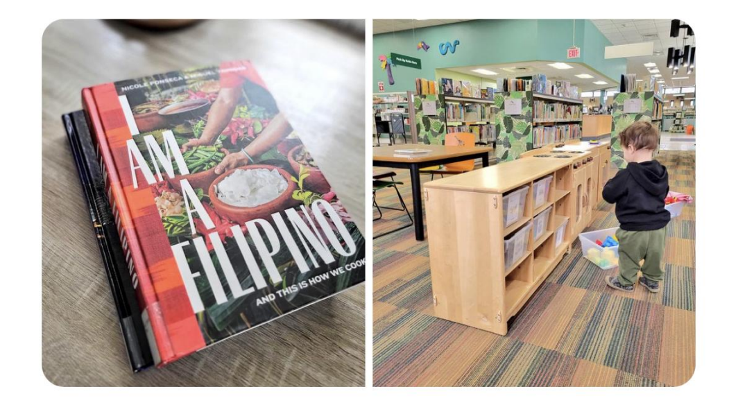
14:20 · 2/27/23 from Greenbelt Branch Library · 61 Views

I really do love @PGCMLS & the Greenbelt branch. My kid has a blast, and I unexpectedly find cookbooks I've been wanting to read! The best.