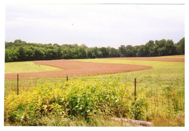
Field Strip cropping System