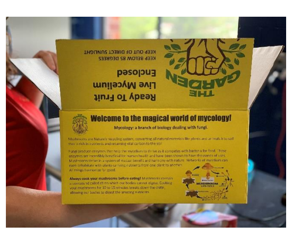
The Garden International (mushrooms)