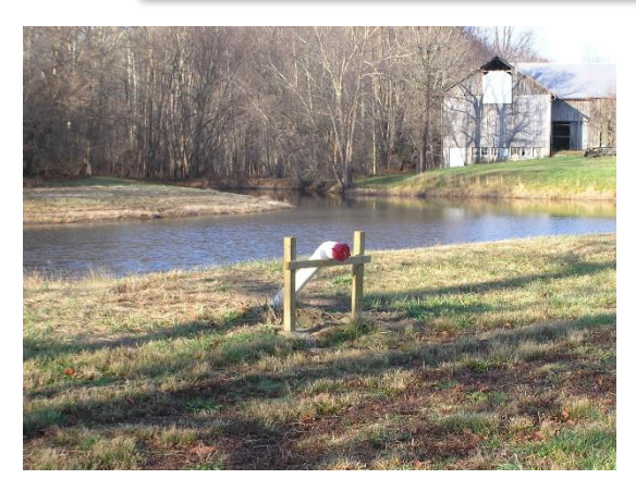
Dry hydrant in farm pond