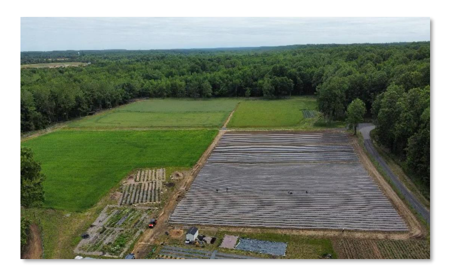
Sweet Love Flower Farm, Ecoblossoms Farm & Purple Mountain Organics at Clagett Landing Road, Patuxent River Park