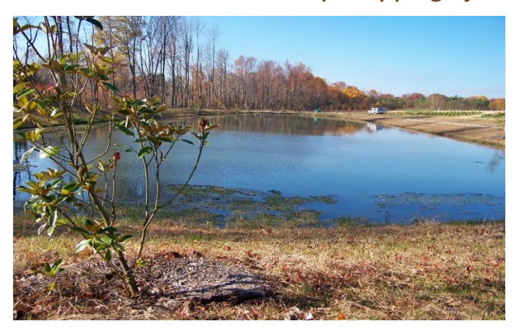
Farm Irrigation Pond