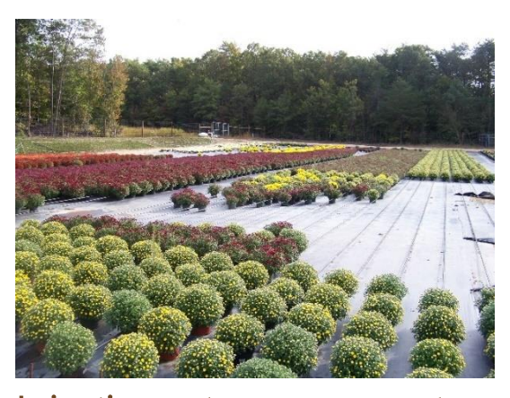
Irrigation water recovery system