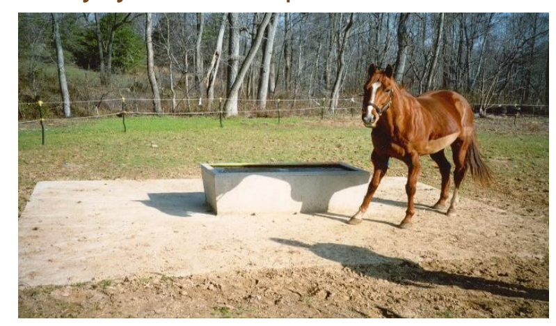
Watering Facility for Livestock