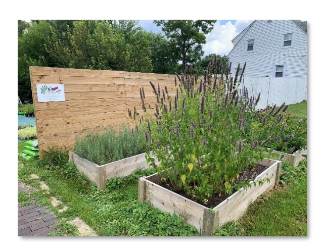
Millie Farms (native plants & flowers)

Assisted 56 urban farmers (167 contacts) & 45 stakeholders (110 contacts) with technical assistance Conducted 23 outreach events (trainings, workshops, and presentations) Provided support Urban Farm Incubator @ Watkins Regional Park