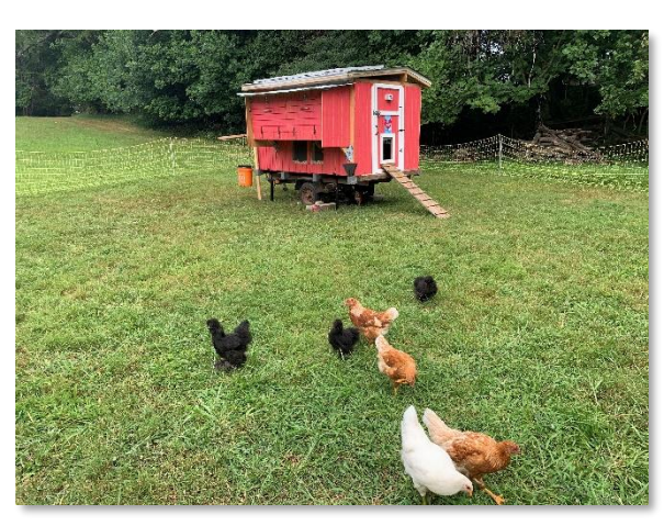
Curemore Farms (produce, herbs, eggs, honey)