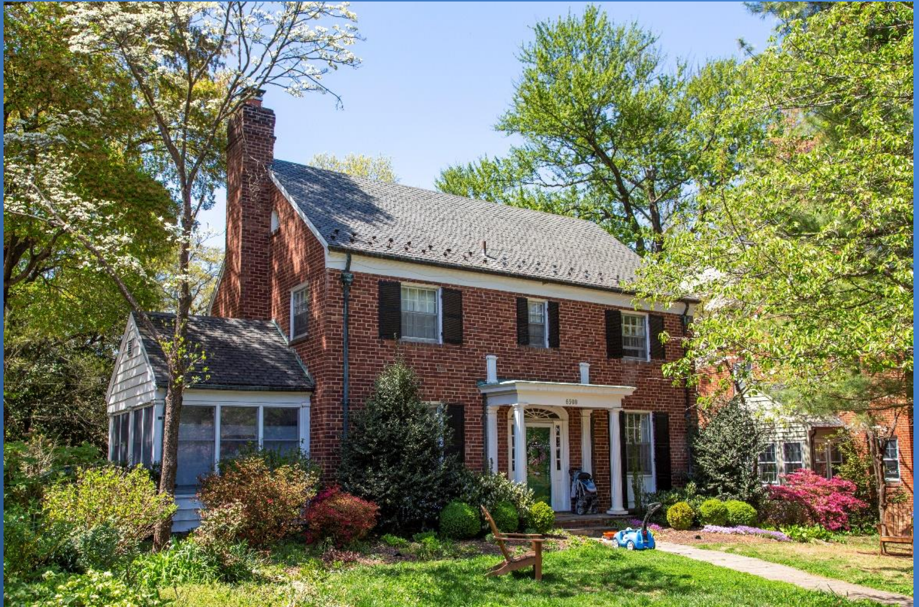
Yates and Mary Boswell House, southeast view, April 2023.