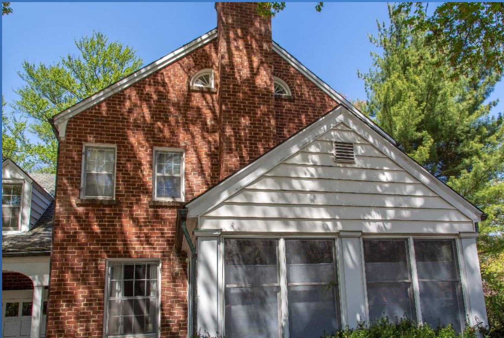
Yates and Mary Boswell House, south elevation, April 2023.