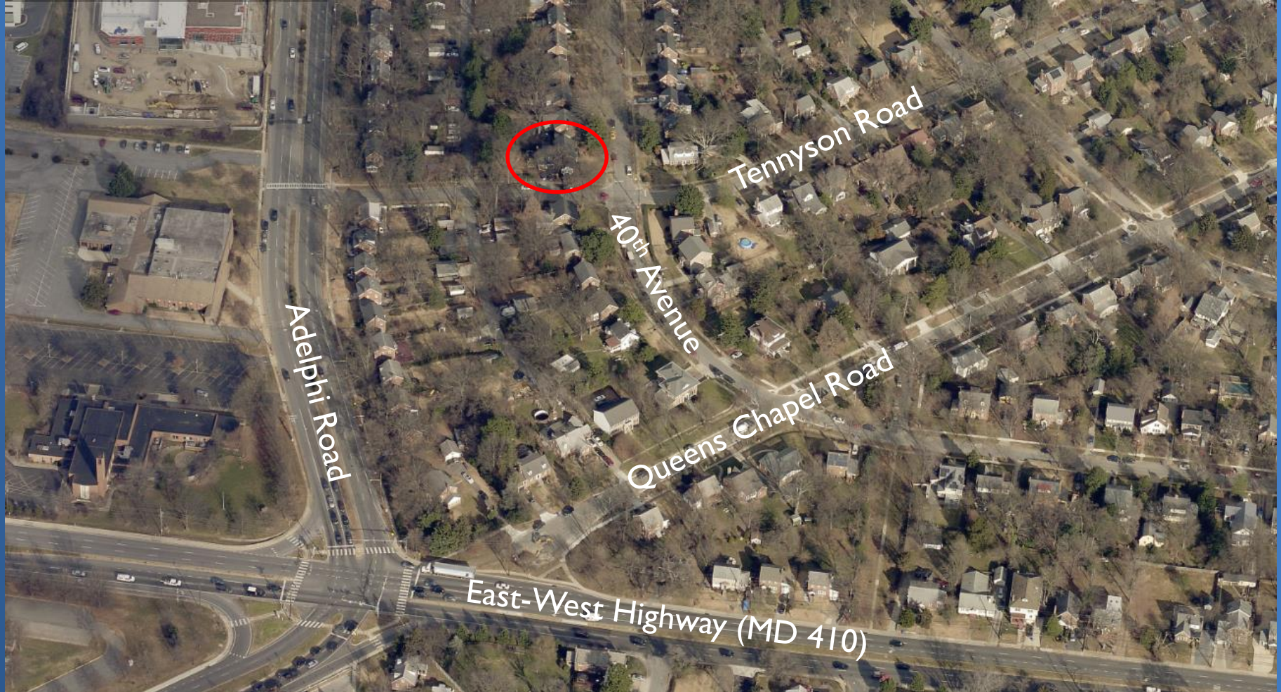
Yates and Mary Boswell House, oblique aerial vicinity view, January 2021. (property location circled in red)