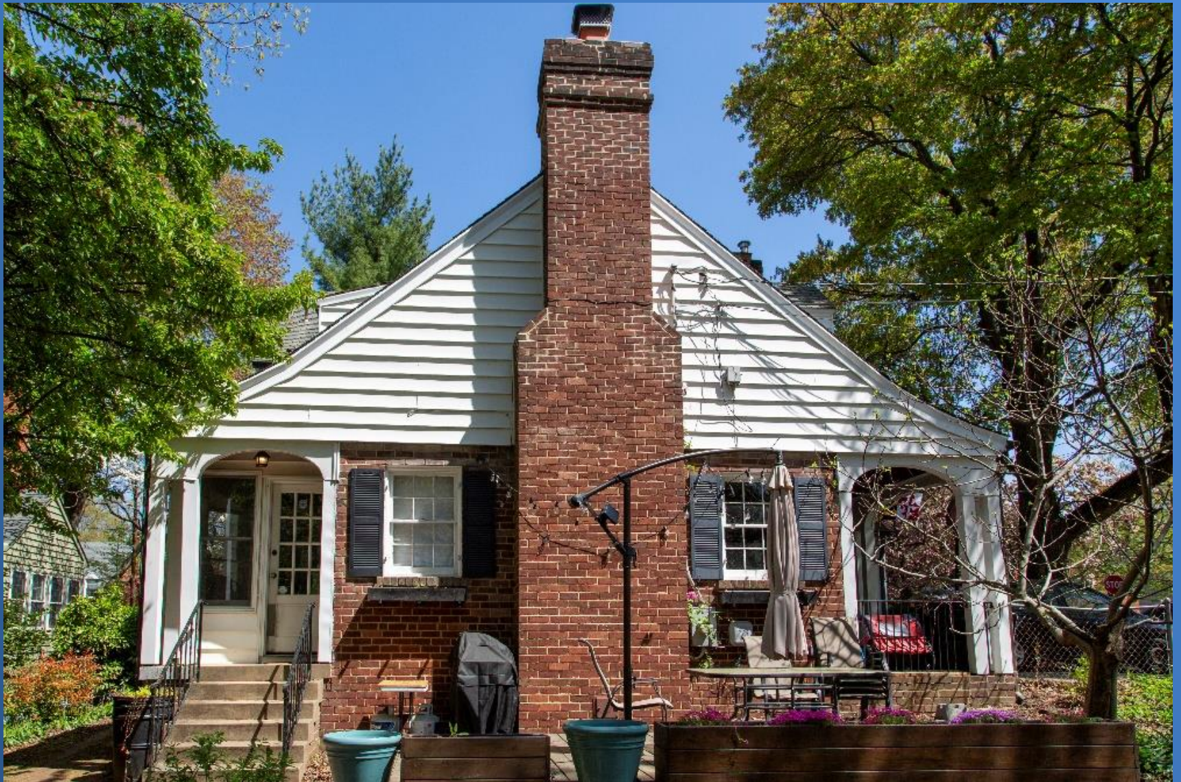
Yates and Mary Boswell House, rear elevation, April 2023.