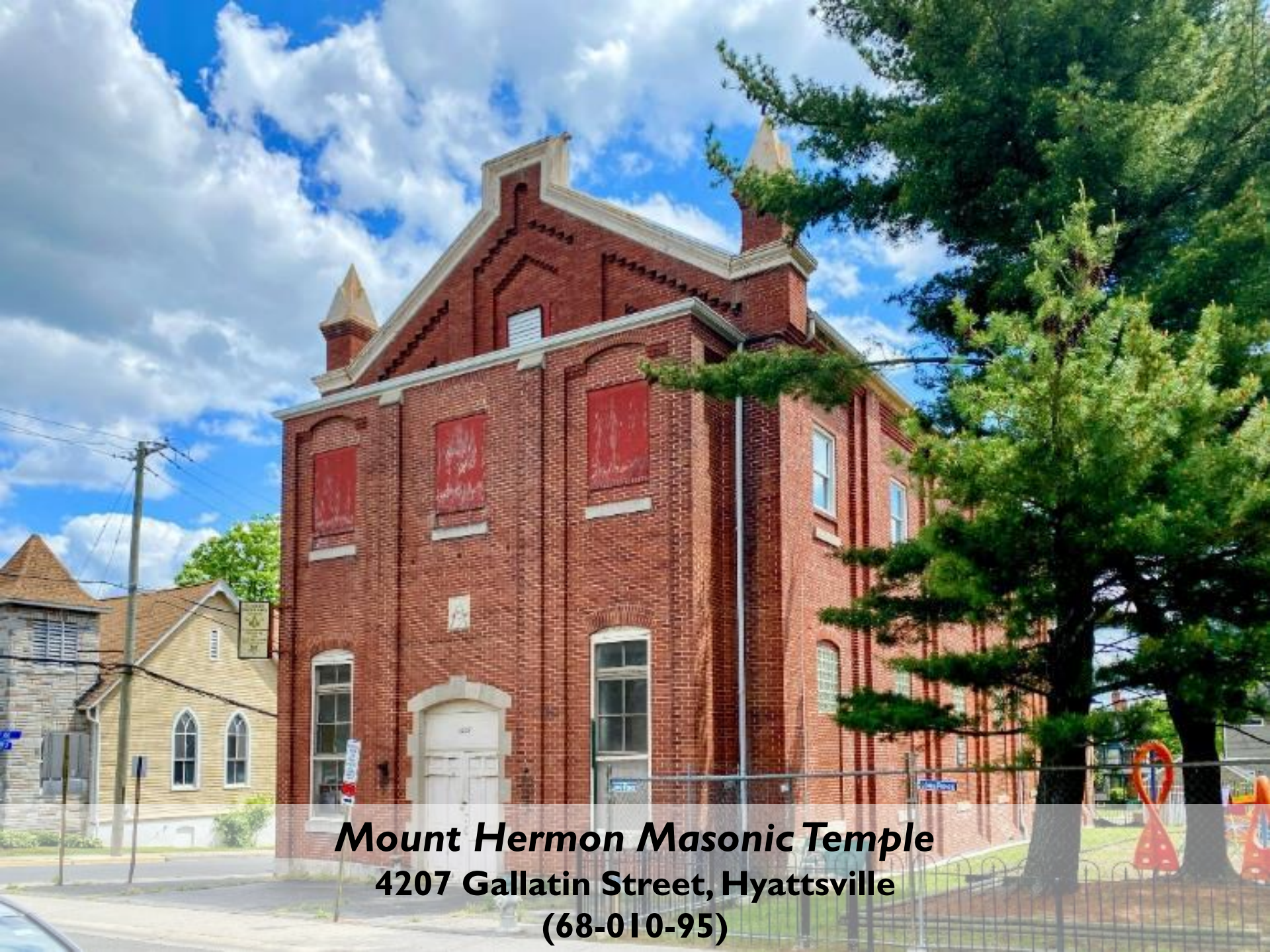
Mount Hermon Masonic Temple 4207 Gallatin Street, Hyattsville (68-010-95)