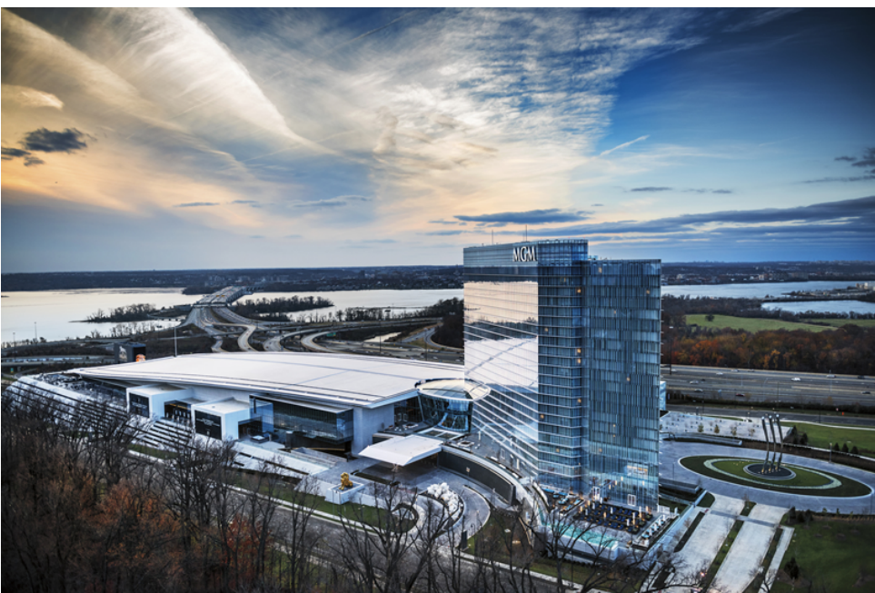
Aerial views of MGM National Harbor, December 2016