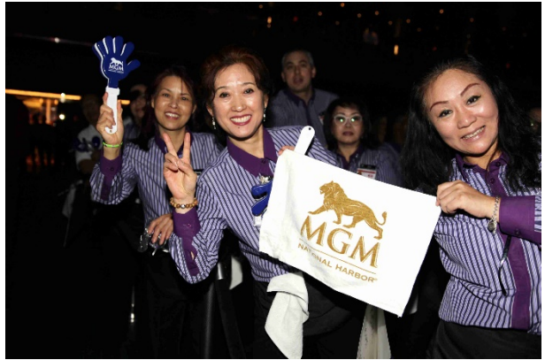
<u>In picture:</u> MGM National Harbor staff during an internal pep rally before official opening.

MGM National Harbor is working with the people who represent the best of the region's talented and skilled workforce, building on the diversity that makes a community strong.