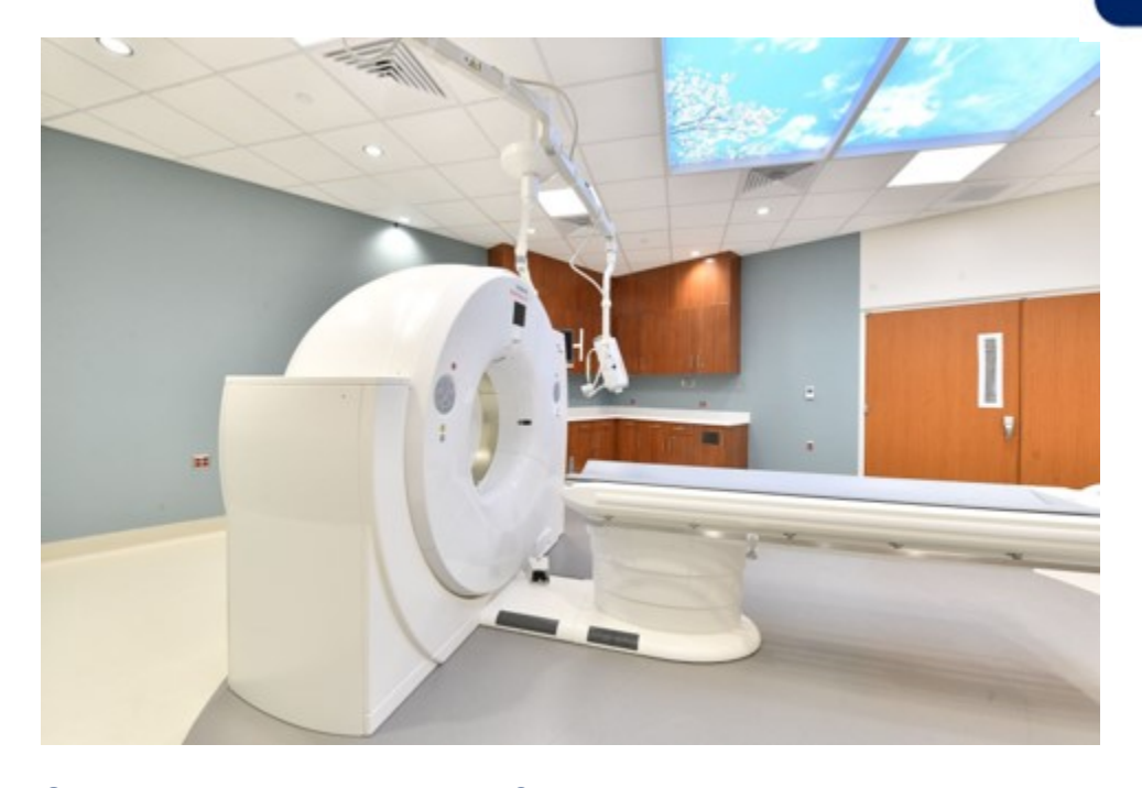
Our ED has a new 128-slice CT machine. In August, we will add a new MRI.